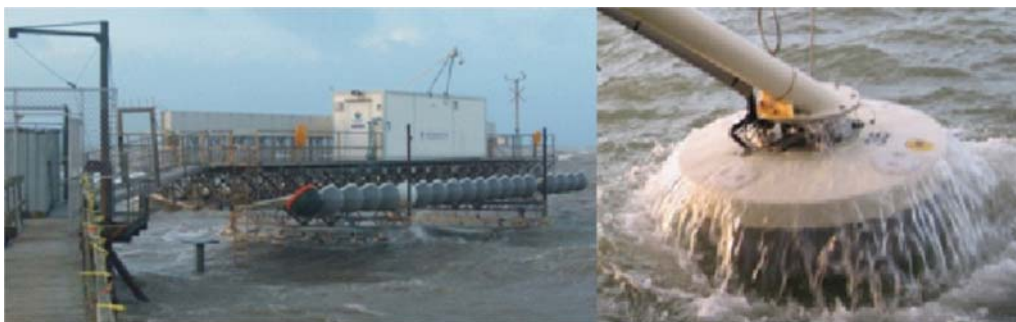
Figure 1: left: WSE view at the pier (Nissum Bredning, DK); right: WSE Floater back view

In the next figure, a view of the Nissum Bredning 1:10 scale is presented in storm protection mode.