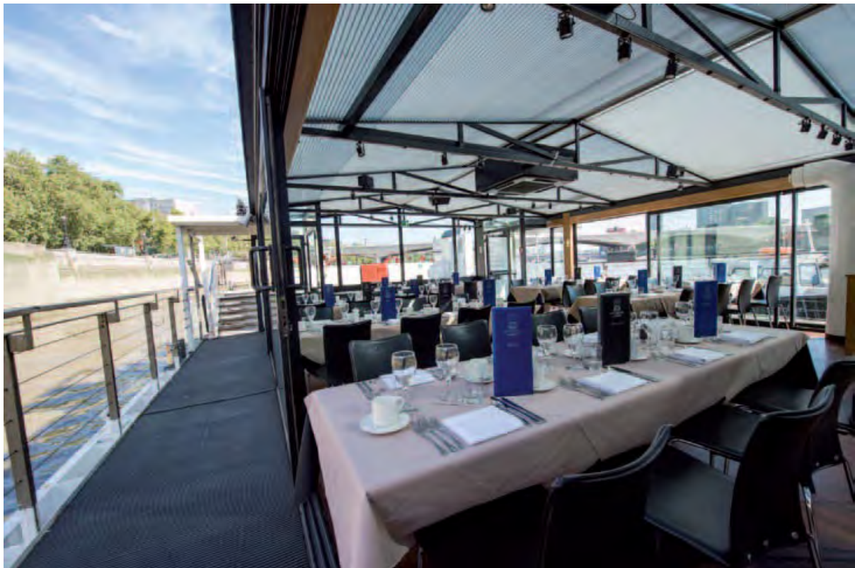
The Tower Room