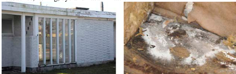
Fig. 4 External and internal photo of case 1

Case 1 (C1) - The house had visible mould growth and was scheduled to undergo comprehensive renovation. When living in the house the inhabitants reported symptoms such as worsening of asthma symptoms in one child, headaches, itching, eye and nasal irritation.