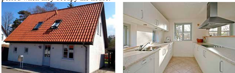
Fig. 6 External and internal photo of case 3

Case 3 (C3) - At the time of inspection, the house had been closed down for the winter. It presented a damp smell but no visible mould growth. The inhabitants report no symptoms and have no complaints in the summer period when they occupy the house.