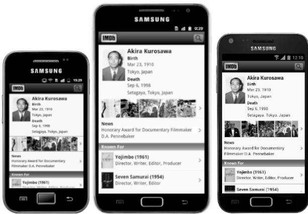
Figure 2: The mobile phones used in the experiment, running IMDb. From left to right Samsung™: a) Galaxy Ace, b) Galaxy Note, and c) Galaxy SII.

In order to investigate these hypotheses we adopted a between-groups experimental design [19] where we asked three groups of users to interact with the same application on three different devices and then formulate their view about it (each group interacted with one device).