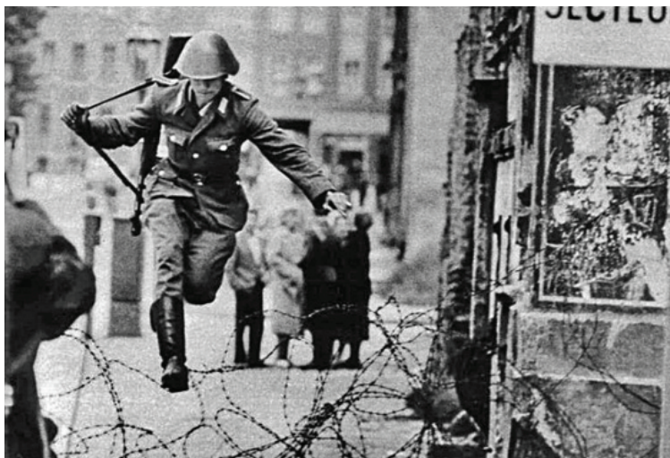
Figure 3. The Leap into Freedom (1961)

Drogo spends the whole novel waiting for someone to cross the border, who can give meaning to his job and, therefore, to his life. However, neither his life nor the border have any meaning because there is nobody (no “other”) to make it meaningful. Despite no enemy ever appearing, Drogo courageously serves until the end of his life. Buzzati elegantly shows how the fate of the border guard is firmly interwoven with that of the border he is guarding.