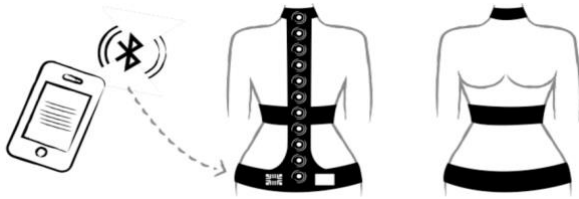
Figure 1: Text Me

Touching you/me with my breath by Patricia Reis is an interactive, non-visual device which aims to bring people together via breath, or allow someone to explore their own sense of pleasure via their own breath. As breath is sensed, a microcontroller translates the rhythm, intensity and humidity of the breath into vibration patterns using 10 motors on an adaptive textile belt. This piece is again, genderless