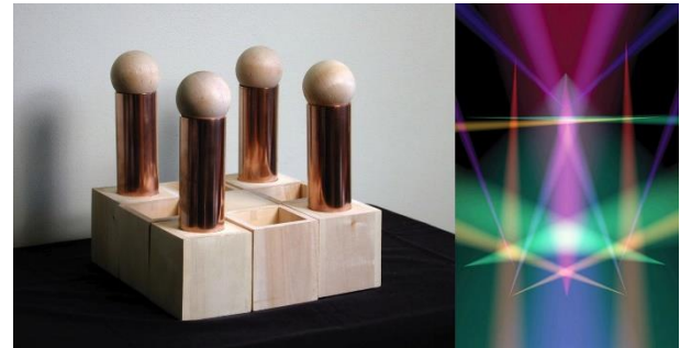
Figure 4: The left image is the “ Variations ” interface exhibited in the First Beijing International New Media Arts Exhibition, 2004. The right image is the “ Buddha Light Painting ” in the Art in the Digital Era exhibition in Guangzhou, China, 2010. (Images Copyright © Bruce Wands.)

These two examples illustrate how digital art has expanded the creative options available to the contemporary artist. While it is beyond the scope of this presentation to explore all the evolutionary and revolutionary changes made to art making, the Internet contains hundreds of websites of digital artists.