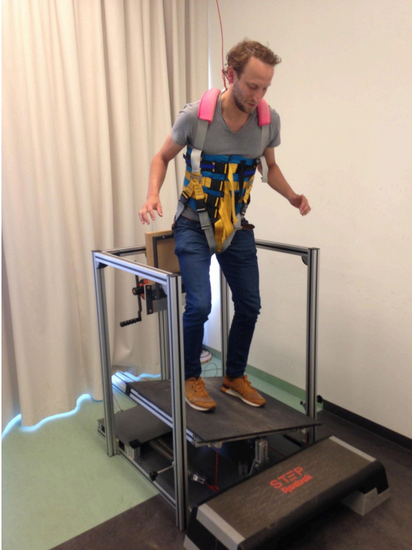
Figure 1. Balance board set-up. Springs were attached to each side of the front of the balance board. Rotational stiffness could be adjusted (0-220 Nm/rad) by using either one or two parallel springs on each side, by altering the springs' moment arm, or by changing the springs themselves (800 N/m vs. 390 N/m). Patients wore a safety harness.