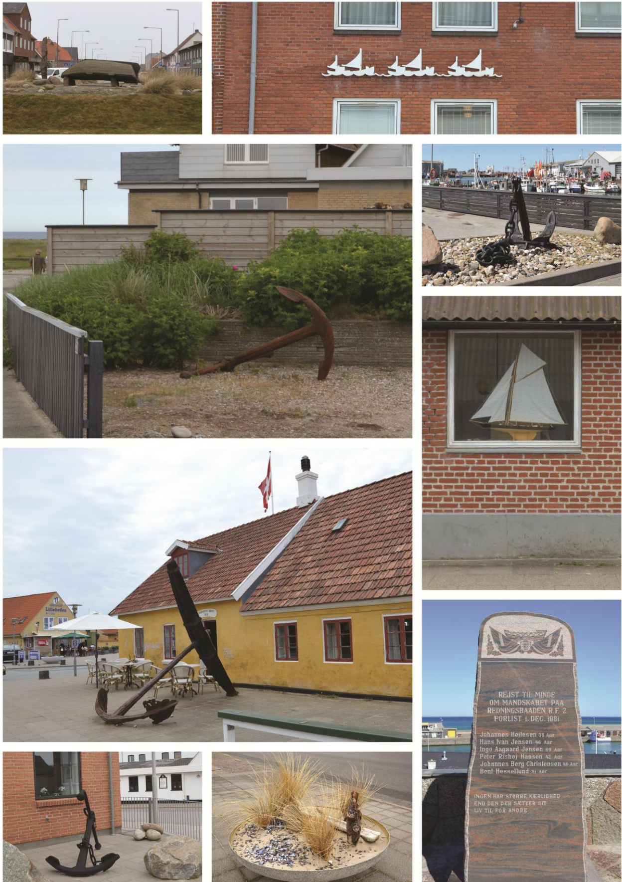
Figure 6. Visual markers of fisheries cultural heritage are omnipresent.