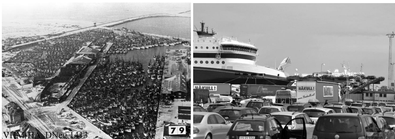
Figure 8. Changes in Hirtshals: Once one could walk across the decks of fishing vessels lined up in the harbor (left). (© Historisk Arkiv Hjørring). Now, one could walk across the hoods of cars lined up for the ferry (right). (© Port of Hirtshals).