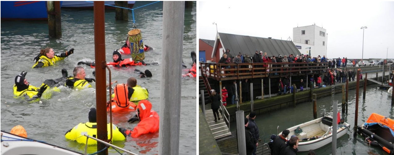
Figure 4. Photographs of Fastelavn activities at Hirtshals harbor in 2014: Participants in the water with Fastelavn barrel suspended overhead (left) and spectators lined up along quay to watch those in the water (right).

water and later to enjoy fish cakes and pastries. The Fish Festival runs every summer, including a competition among prominent chefs in North Jutland, cooking workshops for families, harbor trips, guided tours of the fish auction, educational materials about fishing, and competition for the best local aquavit. The Fish Festival has evolved into a regional attraction, whereas Fastelavn remains a very local community event.