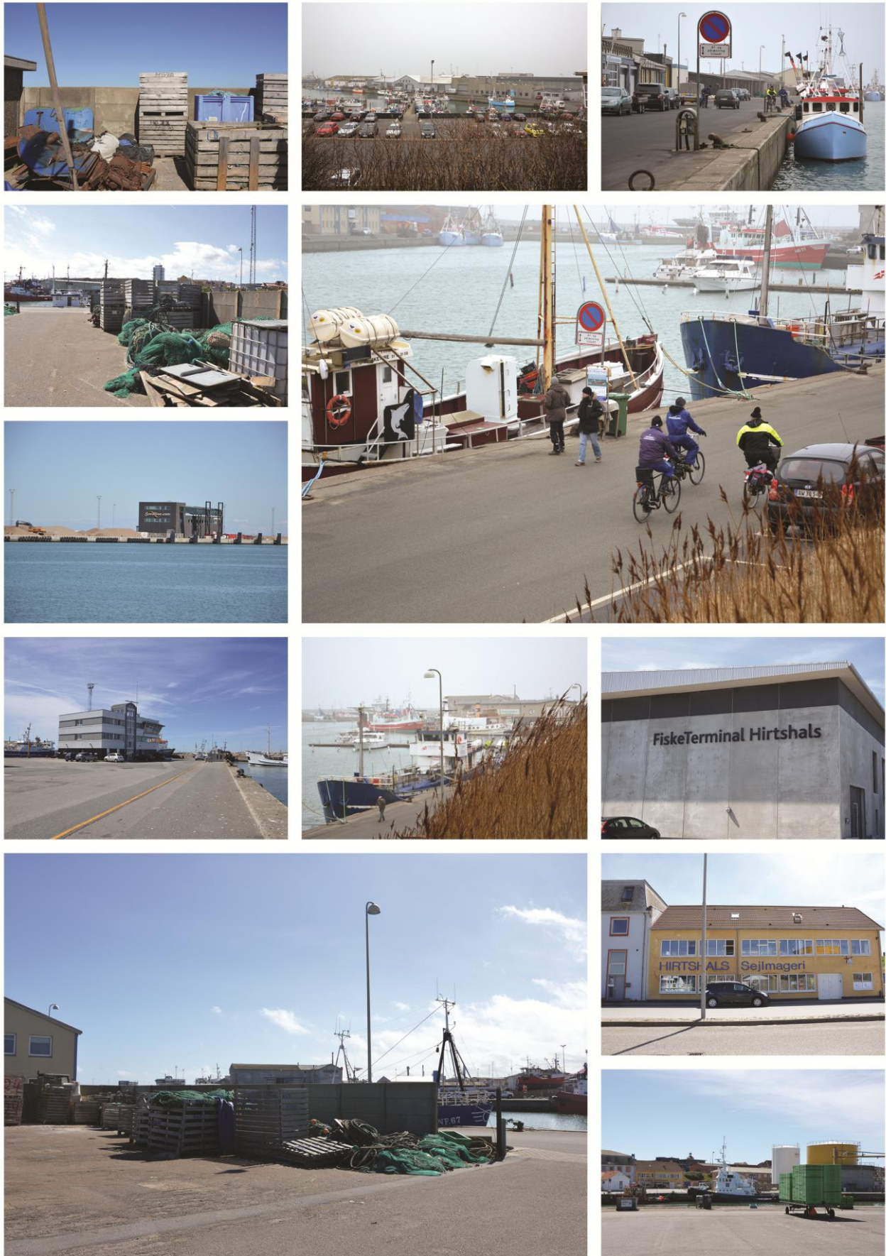
Figure 5. Different views and impressions from a 'harbor round'. (Photos by I.S.G. Lange).