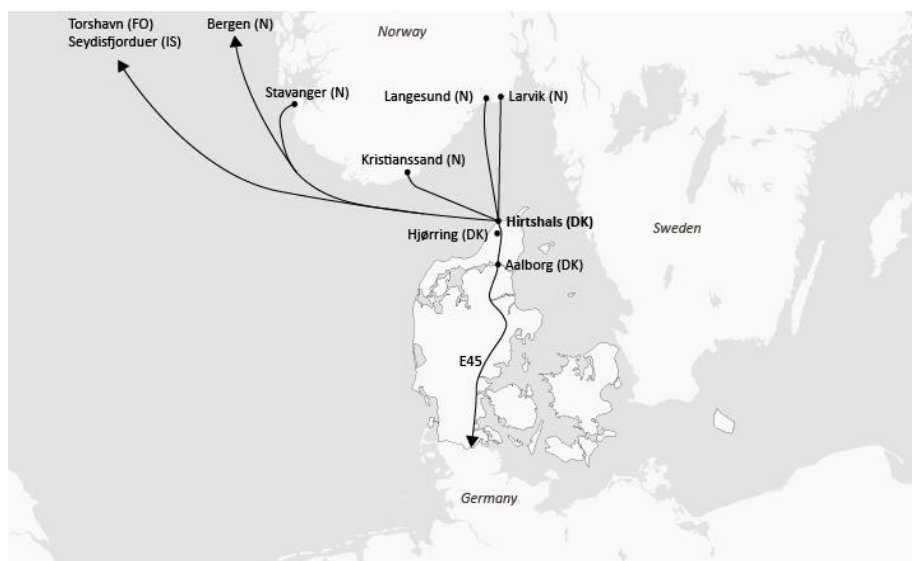
Figure 3. Hirtshals in an infrastructurally connected global geography. (map by I.S.G. Lange).

In this section, we first provide a short introduction to the case for contextual clarity; then we describe how fisheries has been a historical cornerstone of Hirtshals and still is recognized as contemporary heritage by the locals. Following this, we elaborate on the comprehensive transition from fish to transit in the core of port activities and present implications for town residents. From the analysis we will show, according to the categories by Ducruet (2007) how Hirtshals over time has changed from being a coastal town, over a cityport, then an outport to now being best described as a hub port. Looking into the transitions we will focus on the implications to the local community.