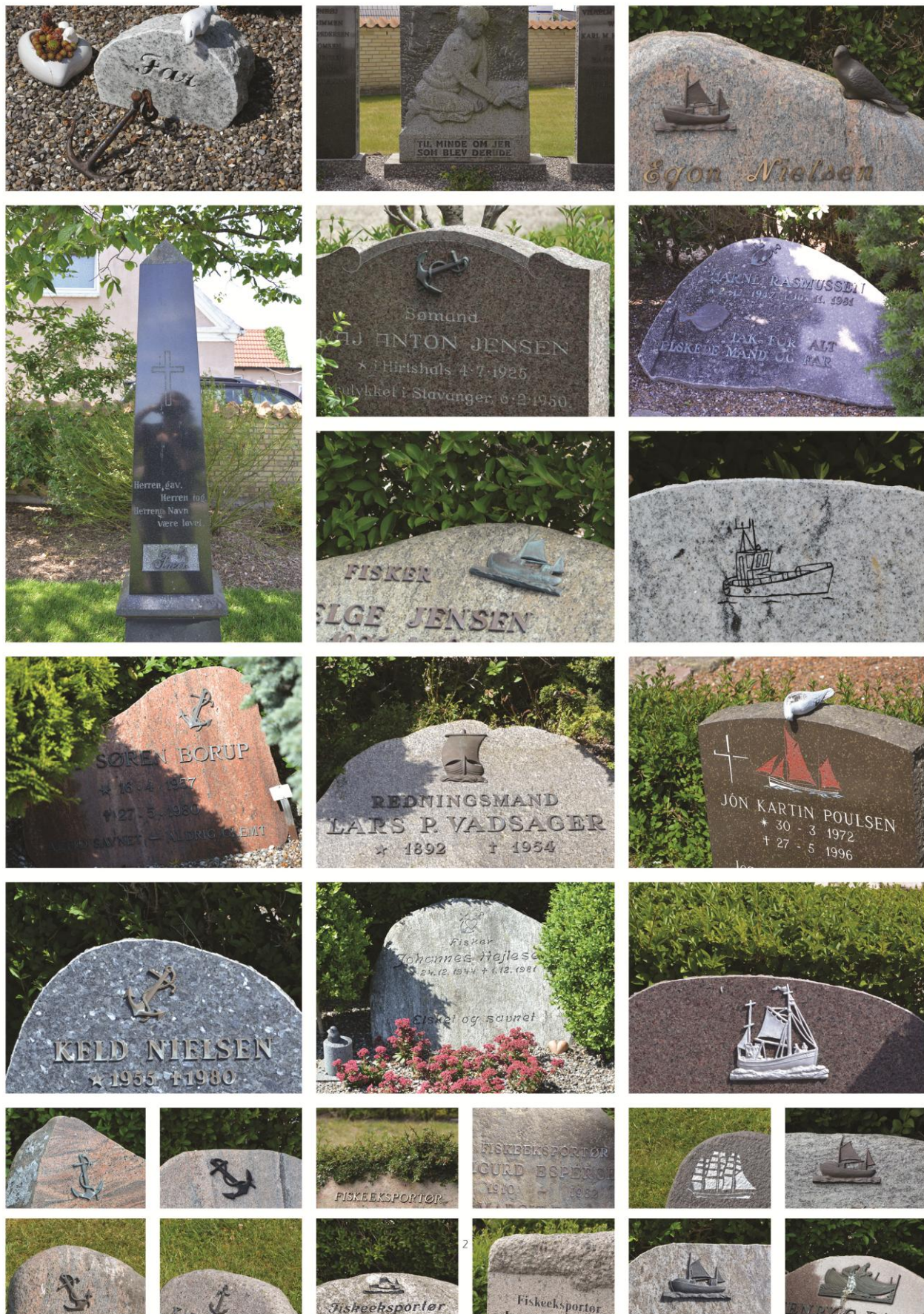
Figure 7. Many grave markings in the cemetery include maritime insignia.