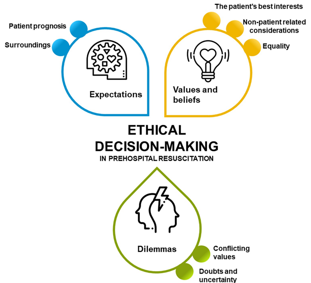
Fig 1. Themes and subthemes. Figure displaying the identified themes and subthemes.

https://doi.org/10.1371/journal.pone.0284826.g001