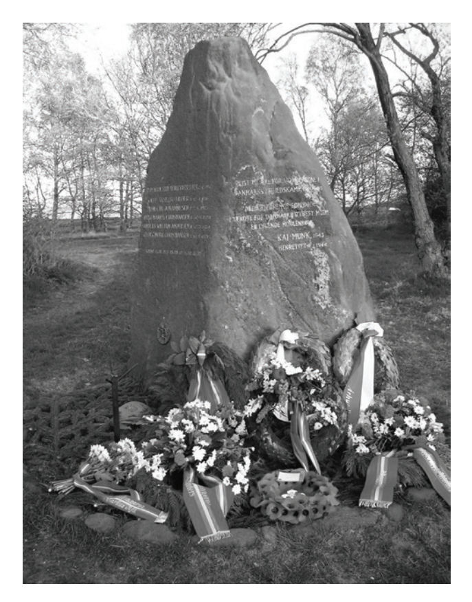
Figure 3: The memorial stone at the execution site of Skæring Hede.

in memory of three local resistance fighters who lost their lives in a firefight on 3 May 1945. Here they have chosen or retained the form "i dybest Mulm." On the carved relief, a man with a plough and a man with a rifle shake hands, confirming the mutual understanding and acceptance between the unarmed and the armed resistance.