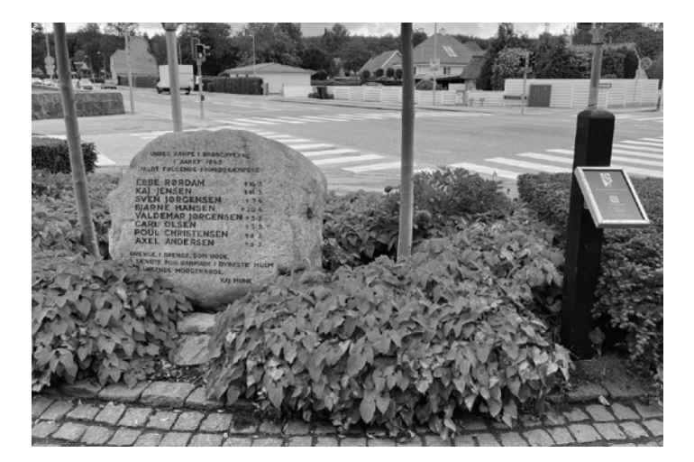
Figure 4: The memorial for fallen resistance fighters in Brøndbyøster. To the right stands the sign with the QR code granting access to the "music video" of "De Faldne."

World War II.<sup>23</sup> Through Ole Rønnest, the Kaj Munk Forskningscenter, represented by Peter Øhrstrøm, was consulted in order to make an informed choice of a suitable version of the poem, a process in which I also became involved.<sup>24</sup>