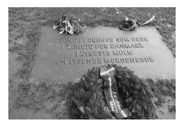
Figure 2: The memorial stone at the execution site in Ryvangen.

The shot-scarred poles stood for many years on the site. They were replaced by bronze castings in 1967, when the original poles were moved to the Freedom Museum in Copenhagen.