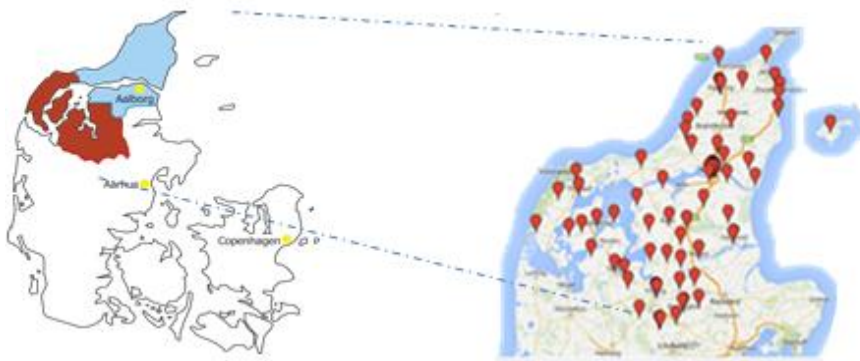
Figure 3.1: Geographical setting of the study. Left; Denmark with the two counties highlighted. At the top is North Jutland county and below Viborg county. Right; Each participating general practitioner practice (89) marked in an enlarged copy of the two counties (84 marks and 5 parallel addresses).

In Denmark all citizens have free access to medical care provided by a general practitioner (GP). All 480 GPs in the two counties were invited to contribute in the recruitment of participants to the NCPS. In the end 155 GPs (32%) were interested and willing to invest their time and involvement in the study. The 155 GPs were situated in 89 practices (GPP) with a mixed urban and rural distribution (Figure 3.1).