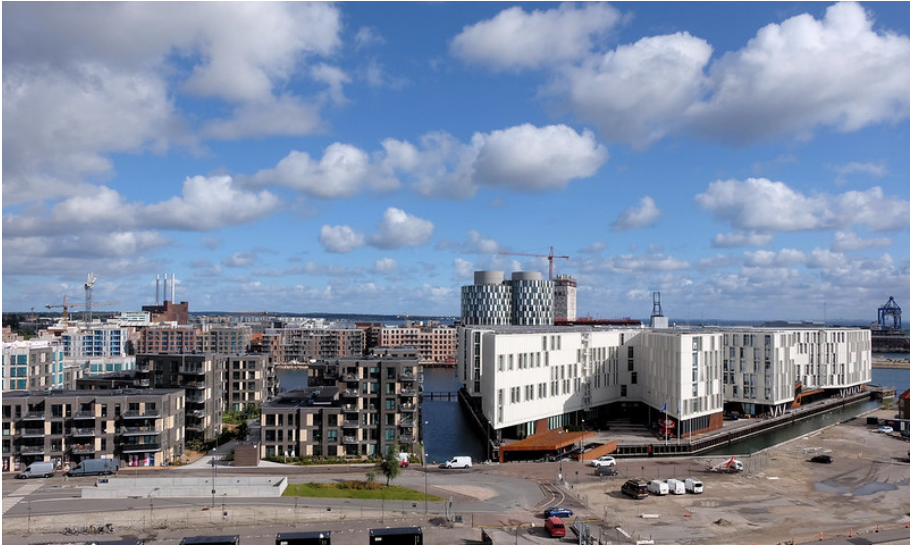
Figure 3: Overview of Nordhavn. Note: Nordhavn with the United Nations building