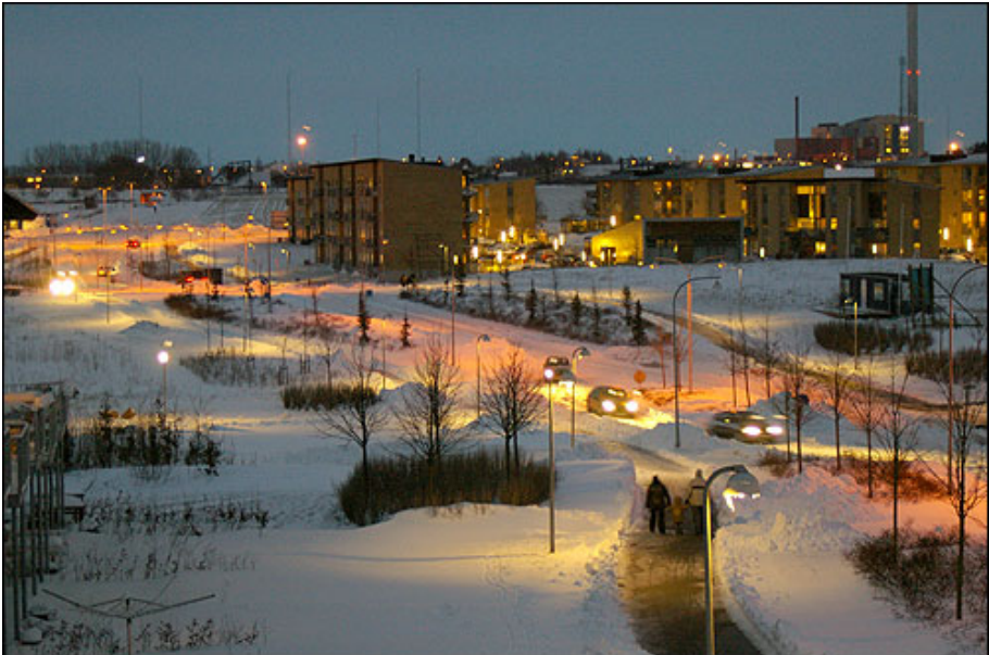
Figure 4: Tre Kroner. Nochnajazima