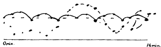
Music example 2:

In the first session I listened to channel 3 -- his emotional baseline as being very sad -- although he expressed verbally being very frustrated. In our pianoduet on the topic: "Allowing myself to try out the instrument -- searching around", he played alternately in the bass and the treble of the piano, not using the middle part. He played fragmented single tones, but gradually there arose some submission in his listening attitude to the music which were audible in his tones being more connected and him being more concentrated in his listening. He was surprised afterwards which he expressed verbally. I played small minor melodies (inspired by my listening to a sad mood in channel 3), which I gradually turned into a repeated softly-stroke note. It sounded almost like a heart beat and gave me something to hold on to, so I could stay fully in my musical interplay and simultaneously be listening in an almost embodied way -- channel 2 informing me of the need for a stable centre.