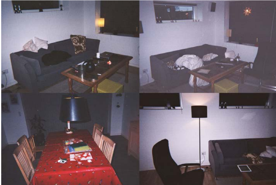
Fig. 1 Kasper Living room and kitchen-dining area

The photos above (Fig. 1) show where Kasper felt most comfortable and most at home, in the living room and the kitchen-dining area. The feelings of comfort and home are entwined; when and where he feels most at home is also when and where he feels most comfortable . In one photo, he was alone reading in the armchair in the living room, the other three show situations with his family 1 . Discussing the pictures, he explained that it is both about the spot in the house, the room, about the furniture that is soft and comfortable, the coffee, Christmas cookies and candles, and about the practices such as reading by himself or relaxing in the company of his family. As such, his feelings of comfort and homeliness are both attached to the material structure of the room and furniture, the bodily sensations, and to the practices such as relaxing or doing social things like watching a film with his wife, watching TV on a weekend morning with his children tucked under the duvet or having the extended family over for a Christmas gathering. To Kasper, feeling comfortable and at home is very much