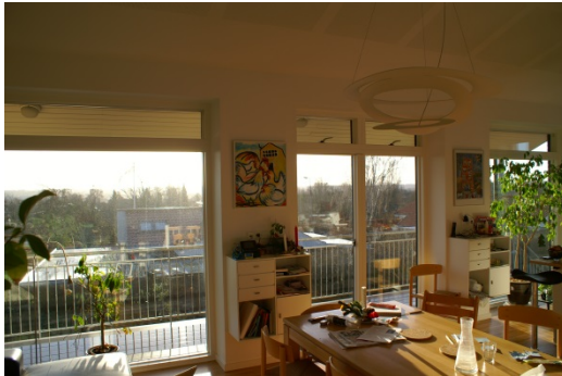
Fig. 10 Jacob Kitchen-dining area

The participants associated the kitchen-dining area with both comfort and homeliness. Jacob photographed the kitchen-dining area to show the inflow of