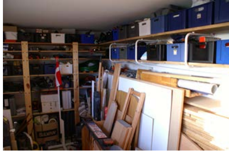
Fig. 7a Jacob Workshop

"I think it's really pleasant to sit in the office, to have that room and environment to work in, you sit comfortably in our office chair and at the table, and there's complete silence from all surroundings, compared to when you're in the workplace... so it's just nice to be able to sit at home and work, you're more relaxed when you work from home, and actually also produce more because it's quiet".