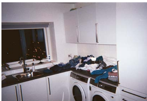
Fig. 2 Kasper Utility room

The photos and the quote together show homemaking practices that contribute to Kasper's feelings and understanding of comfort and homeliness as being closely related; relaxing, reading, watching television, drinking coffee, eating cookies, having a Christmas gathering, in all these practices Kasper feels equally comfortable and at home in the dwelling. On experiences of feeling comfortable and feeling at home, Kasper further explained, referring to the photo in Fig. 2: