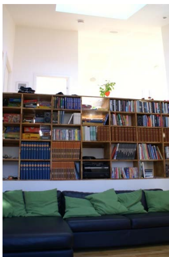
Fig. 5 Jacob Living room

The living room: Relaxing alone and with family