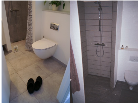
Fig. 8 Jacob & Kasper Bathroom

"(...) our shower, it's a place where you feel comfortable, but maybe not necessarily so much at home, it might as well be any other place, where you stand under the shower head and get thoroughly warm... so, I do also feel at home, but it's more about, you just relax there and feel good in the warm shower."