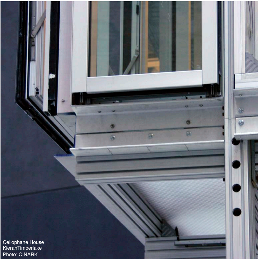
Cellophane House KieranTimberlake

The interplay of construction and construing can be specified as: