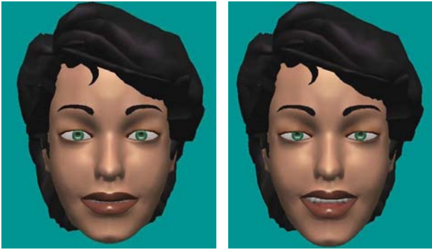
Figure 1: A natural vs. a disgust-lie smile

small presentation by Greta about the local weather over the last two weeks. This topic was chosen due to its small talk character [1]. Afterwards, subjects had to indicate which out of ten different movie genres Greta might prefer. There was no clearly identifiable genre the subjects associated with Greta’s preferences. For our first evaluation, we decided to restrict ourselves to five out of the ten genres: horror, adventure, animation, comedy, and action.