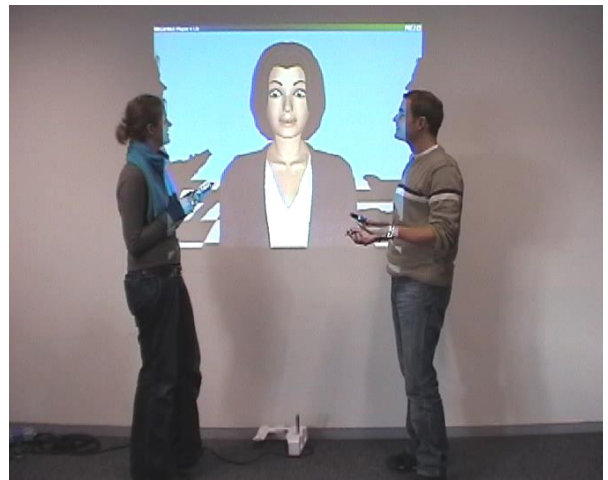
Figure 2: The setting

In order to make sure that the users paid sufficient attention to the agent's behaviour (and did not just concentrate on the PDA display or the other user), they were told that the agent might not be able to conceal her emotions perfectly, but left it open how deceptive behaviours might be detected. Consequently, the subjects had no idea which channel of expression to concentrate on. To incite the sub-