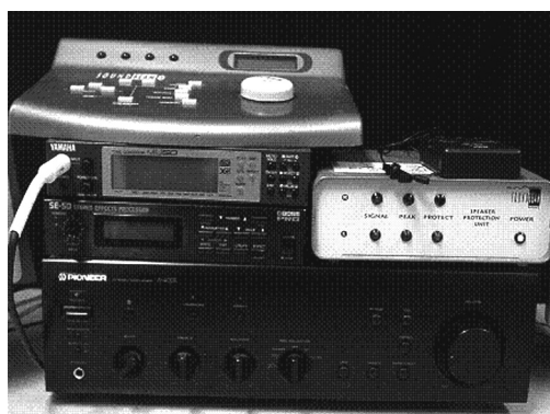
Figure 2. (left) Soundbeam control unit; (upper left) stereo sound module and stereo effect processing unit; (left middle) speaker protection unit for vibroacoustic soundbox (white) with wireless microphone upon it. All rest upon the main system stereo amplifier.