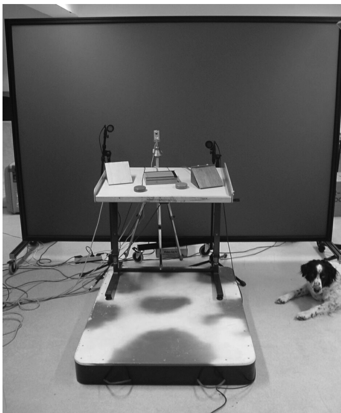
Figure 1. Two Soundbeam sensors on stands plus camera on tripod in front of the back projected Perspex screen. The table with tactile switches rests upon the vibroacoustic soundbox platform.