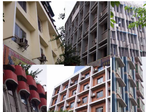
Figure 7 concreted external shade devices in Chongqing

The fixed shading can reduce the direct irradiation, but it still reduces the day lighting for its lack of adjusting capability. Especially, the concreted shading enlarges the external area of the building envelope, thus will intensify the heat transfer between the outside and the indoor climate. In Chongqing, it's will get a reversed result of energy efficiency for most of time. From the view of the author, flexible shading has an advantage use than fixed one in Chongqing.