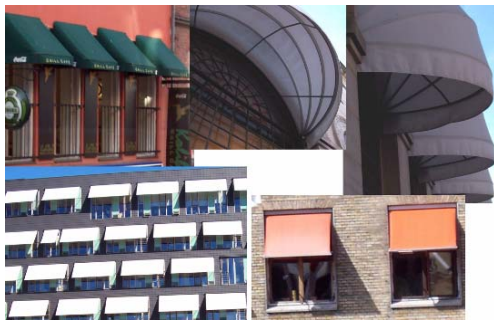
Figure 4 some external shade devices in Aalborg

Buildings in Aalborg often have flexible external shade devices, see in figure 4, which can avoid direct irradiation and can use day lighting to the most degree. The shade devices can be adjusted to gain energy efficiency in windows. Such principal was used in the internal shade devices too, see figure 5. Some buildings, for more advanced, integrated the adjusting of shade device into the IT system of the buildings, thus made the shade devices adjusted automatically to the outdoor and indoor climate, see figure 6.