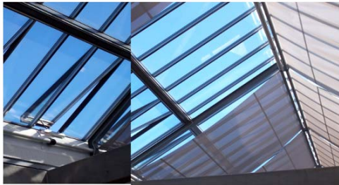
Figure 2 skylight of atrium in Aalborg

It seemed no need for a deeper compare about the setting of windows, while the design process in the two cities may lead to a tremendous different results in the operation of windows.