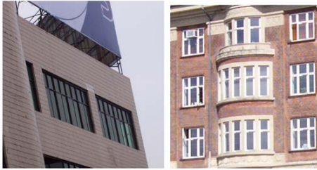
• Chongqing • Aalborg Figure 3 typical windows in Aalborg and Chongqing

It's worthy pointing out that, like most of the Chinese cities, Chongqing has a low ratio of news buildings that fulfill the requirements of J116-2001, which meant the U-values of windows in Chongqing are practically larger than that in table 3.