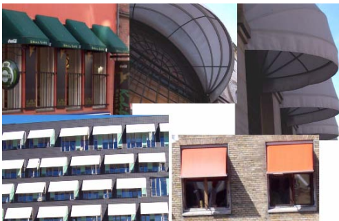
Figure 4 some external shade devices in Aalborg

Buildings in Aalborg often have flexible external shade devices, see in figure 4, which can avoid direct irradiation and can use day lighting to the most degree. The shade devices can be adjusted to gain energy efficiency in windows. Such principal was used in the internal shade devices too, see figure 5. Some buildings, for more advanced, integrated the adjusting of shade device into the IT system of the buildings, thus made the shade devices adjusted automatically to the outdoor and indoor climate, see figure 6.