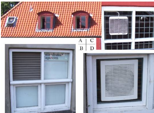
Figure 9 some ventilation modes in Aalborg

Ventilation is an important function of windows. When the temperature, humidity and cleanness of outdoor air are beneficial for the indoor climate, natural ventilation is the best way to be used (see figure 9-A). Whereas, when the enthalpy difference between outdoor and indoor air is not fit for natural ventilation, it's an effective measure to tighten windows and reduce the air infiltration, thus to reduce the energy consumption by windows [6] . In this situation, for a basic provision of fresh air, the mechanical ventilator was developed, see figure 9-B, C, D. It both reduced the impact of disorganized natural ventilation on the indoor climate and satisfied the hygiene requirement of IAQ. The EU new requirement of energy efficient in buildings demands that the air infiltration must not exceed 1.0 L/s.m 2 at 50 Pa pressure differences, which corresponds to an average air change of 0.1 h -1 .