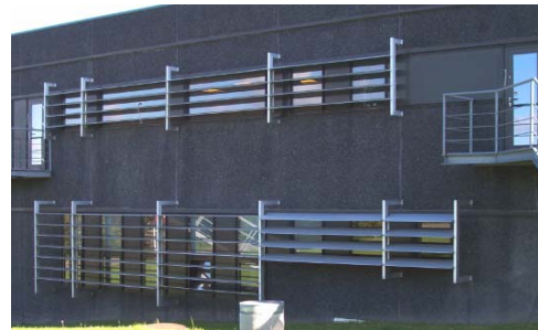
Figure 6 external shade devices in Aalborg

Compared with the flexible shade devices, Chongqing uses more fixed ones contrarily. The shading may be concreted into the building itself, or may be installed after the running of buildings, see figure 7 and figure 8 respectively.