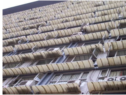
Figure 10 typical ventilation modes in Chongqing

Almost all the windows in Chongqing adopt natural ventilation, see figure 10. Chongqing has a high outdoor temperature in summer (37~39°C), low and moist in winter (2°C and 82%, relative humidity) [8] . Natural ventilation may increase the air-conditioning energy much higher, which is opposite for the aim of energy efficiency in windows.