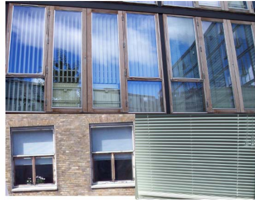
Figure 5 some internal shade devices in Aalborg