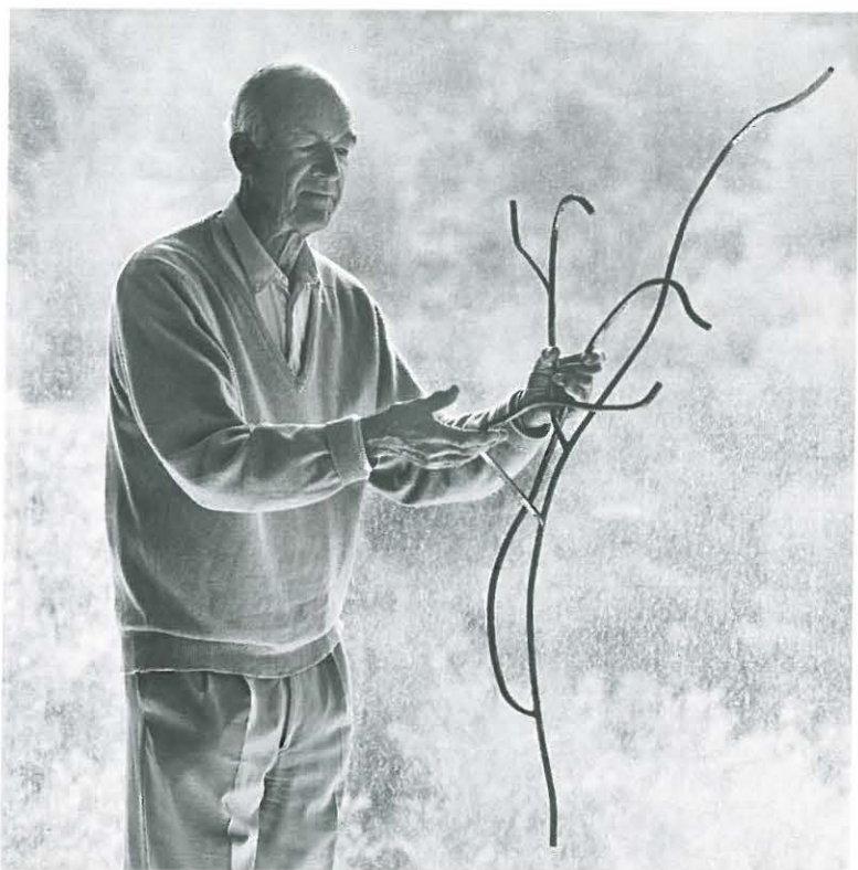
The essence of Danish architect Jørn Utzon's architecture is a fusion of form and structure inspired by nature and the visual universe of other cultures.