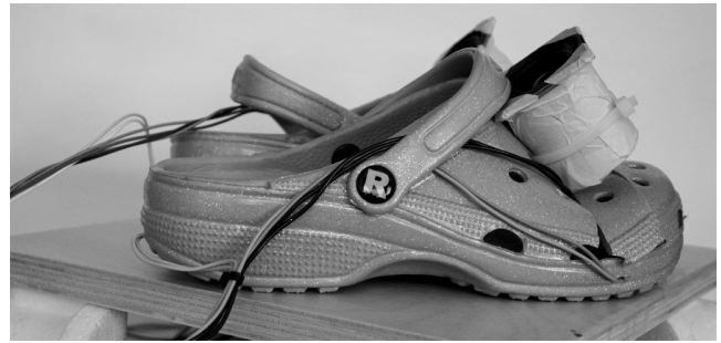
Figure 2. A pair of sabots with sensors in the soles. The loudspeakers are fixed to the shoes instep.

The audio display is provided by two 4\Omega Visaton FRWS5 loudspeakers, which were chosen for their low weight and small dimensions. Each speaker is attached onto a shoe, on the surface of the instep. By employing the laptop battery to power the acquisition and computation systems, plus a 9V battery to supply the small loudspeakers, the problem of wearability is addressed. On the other hand, in order to make the system wearable, the loudspeakers have to be small and light, this way raising problems of poor sound quality especially at low frequencies. This problem is addressed by enhancing the system with a portable subwoofer.