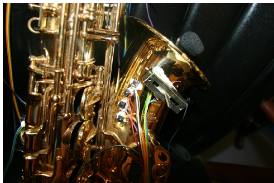
Figure 1: Closeup of the fader and pushbuttons on the psychoPhone

When scratching on a classical vinyl DJ setup, the DJ is typically 'opening' and 'closing' the sound using a fader in one hand - and moving the vinyl back and fourth with the other hand.