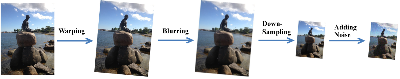
Fig. 3 The imaging model employed in most SR algorithms.