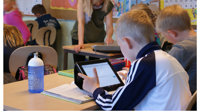
Figure 3. Young students working with media tablets.

teaching, and more specifically, situations in which the media tablet became a teaching tool and/or learning device [36] (Fig. 3).