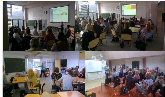
Figure 4. Discussing the results with the teachers.

c) The online survey, which regarded all teachers, comprised 22 items; closed questions on the teaching practice using media tablets. It was conducted in September 2013 and pre-tested in the summer of 2013. From a total of 170 teachers in Danish schools, the online survey was answered by n=148 teachers from all seven schools in the municipality, who started to use media tablets in January 2012. Some of the teachers skipped some questions. 85 were completed; response rate was 50.2 percent, 30 male and 70 female teachers. The teaching practice ranged from less than 1 year to 35 years (mean = 17-18 years; median: 16-17 years, standard-dev. 11). The results from the observations, the interviews, and the online survey, were presented and discussed with all of the teachers, see Fig. 4.