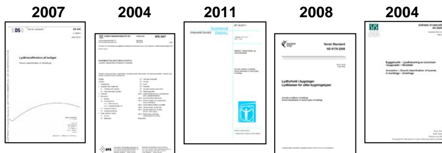
Figure 1: Nordic countries. Sound classification of dwellings, status March 2012 for classification schemes published by national standardization organizations.

National schemes for sound classification of dwellings exist in all five Nordic countries, cf. [1, 2, 3, 4, 5]. Some of the schemes include classification criteria for other types of buildings than housing. The class criteria for dwellings originate from a common Nordic INSTA-B proposal from the 1990s, cf. latest draft [6], thus having several similarities, but also many differences due to the development in national standardization committees, after the Nordic coordination stopped. The classification schemes are published in national standards. The class criteria relate – like the building regulations – to airborne and impact sound insulation, noise levels from traffic and technical installations as well as other acoustical and noise aspects. This paper focuses on sound insulation between dwellings and of facades.