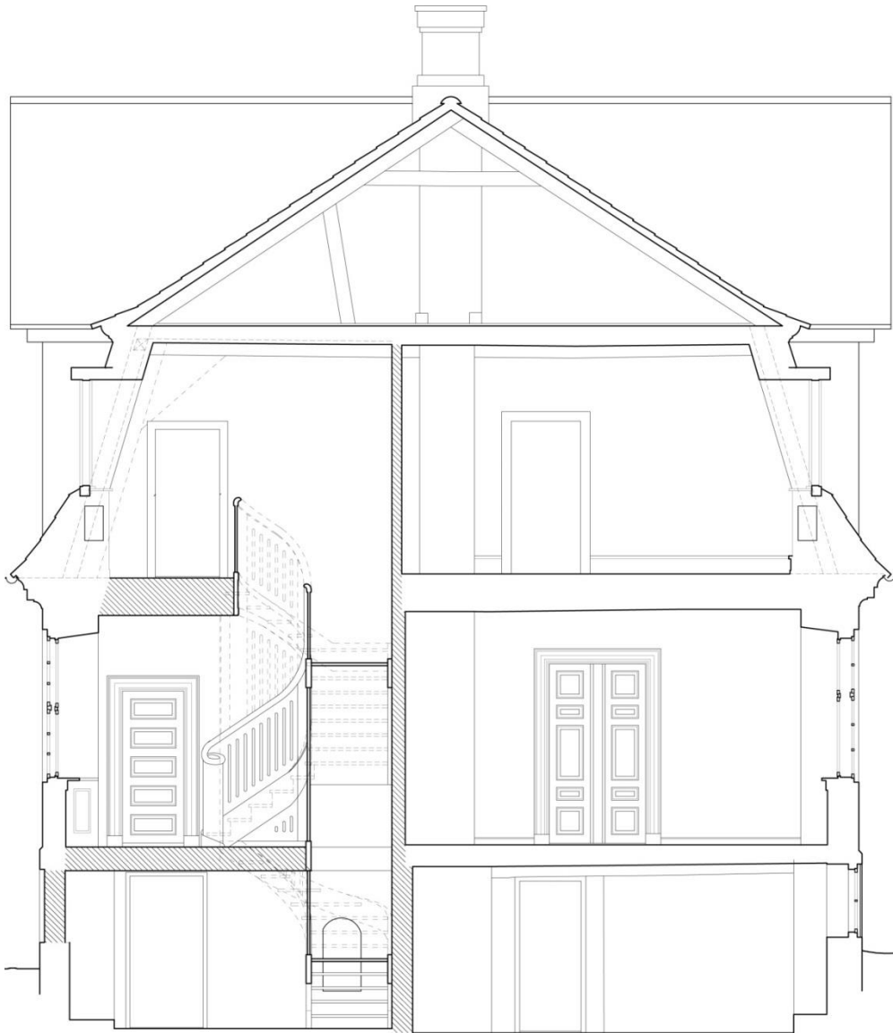
Figure 2. Structural section of the supervisor's residence included in the listed complex, Fæstningens Materialgård .