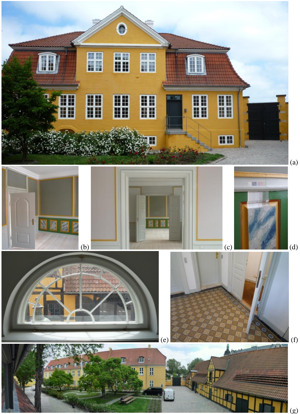
Figure 4. Photos of the refurbished listed complex, Fæstningens Materialgård . a) The supervisor's residence including the photos Figure 4 b) to Figure 4 f), b) Entrance to the main living rooms, c) The living rooms, three rooms in a row lying towards the street, d) Layers of paint found during the restoration and now reviled, e) A window in the staircase, f) The floor-tiles in the entrance hall and staircase, g) Panorama view over the courtyard of the refurbished listed complex, Fæstningens Materialgård .