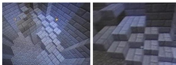
Figure 2: first attempt to create a spiral staircase (left), and the process of readjusting the staircase (right).

In this case, the boy explained that he was not sure how the stairs was going to look like, and that he was experimenting to find a strategy for building the staircase.