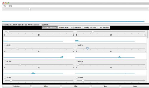
Figure 2: A snapshot from the interface provided with the tool. The upper part presents the initial level design which is modified in realtime to provide visual feedback about designer's choices. Patterns of different components are presented in the lower frames. The designer can activate/deactivate each pattern and change its weight and edits will be directly reflected in the upper frame.

represents a newly generated level. These vectors are then parsed and composed to create a level in its 2D map format that can be loaded and played.