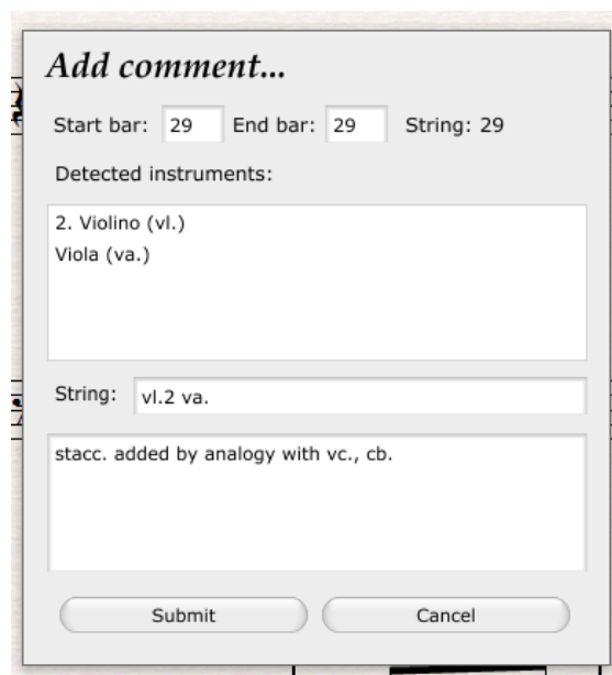
Figure 4. The dialogue presented when adding a comment. Information about the affected instruments and the position has been automatically filled in based on the current selection in Sibelius.

Sibelius allows for mapping plug-ins to user-defined keyboard shortcuts. This is utilized to achieve tight integration with Sibelius. When the defined keyboard shortcut is pressed, the command file is changed, causing the respective dialogue to pop up in front of Sibelius. The user selects a passage in the score, then clicks the keyboard shortcut. This causes the “Add Comment” dialogue to pop up, with bar and part information already filled in, as can be seen in Figure 4. The interface for editing individual comments in the score has a similar design. The web interface is de-