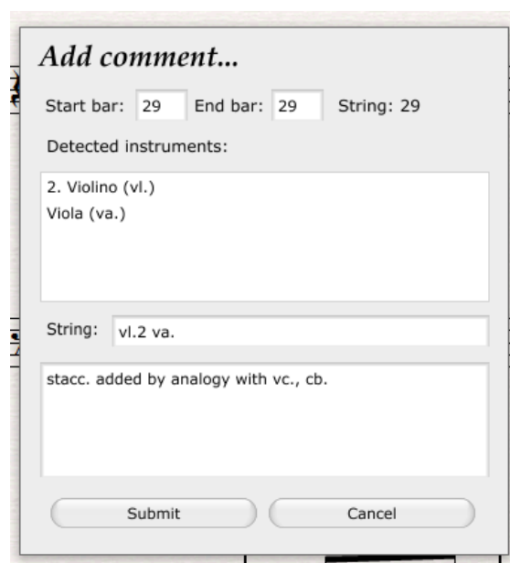
Figure 4. The dialogue presented when adding a comment. Information about the affected instruments and the position has been automatically filled in based on the current selection in Sibelius.

Sibelius allows for mapping plug-ins to user-defined keyboard shortcuts. This is utilized to achieve tight integration with Sibelius. When the defined keyboard shortcut is pressed, the command file is changed, causing the respective dialogue to pop up in front of Sibelius. The user selects a passage in the score, then clicks the keyboard shortcut. This causes the "Add Comment" dialogue to pop up, with bar and part information already filled in, as can be seen in Figure 4. The interface for editing individual comments in the score has a similar design. The web interface is de-