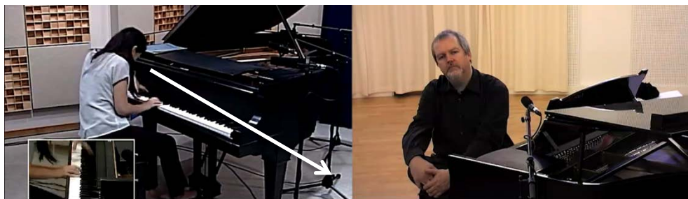
Figure 4: Split-screen recording. The teacher follows body posture on the total and fingering in the close-up picture-in-picture. The student uses her far-end monitor for sideways glances and peripheral views of the teacher.