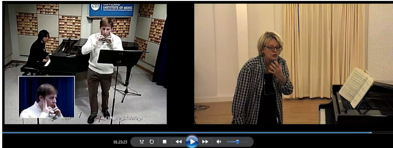
Figure 2: Split screen recording. The teacher and the student work with tensions in the student's jaw.

sessions this is remediated to extreme close-ups of facial details. Telepresent technology affords this but being object to or viewer of these extreme close-ups may personally and socially challenge the experienced telepresence and accordingly also the experience of the third teaching-room . The sound is another challenge as the voice sound is closely connected to the singer's body posture, control of breath and body movement. Therefore, it becomes an issue how different the transmitted sound is from its source in the far-end. Although Internet2 offers the highest quality of sound transmission, the physical acoustics in near- and far-end together with the technicians choice of representing the sound through mixing, affect the shared experience of sound in the third teaching-room and the participants' frame of reference. During a knowledge sharing workshop we learned that these issues are also relevant to wind instruments and even that some instrumental sounds are interpreted as noise by the telepresent technology and subsequently suppressed.