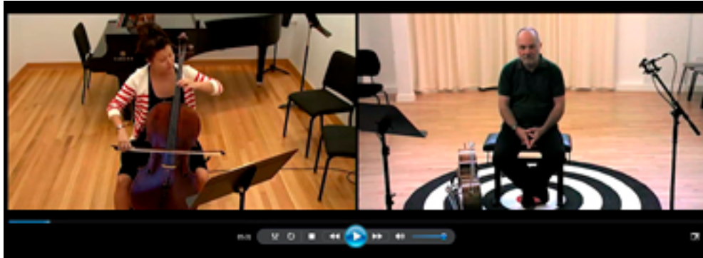
Figure 1: Screen dump of Split screen recording showing far-end (Miami) and near-end (Copenhagen)

In the specific sessions we found differences related to the multimodal sign-systems and multi-sensory systems involved, along with the physical positioning between teacher and student due to type of instrument that affected the VCE-sessions differently. We found that the more direct similarities between conventional and mediated sessions, the less impact of mediation on the teacher-student interaction, their embodied experience and the teachers' professional practice.