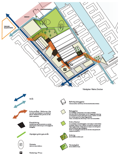
Figure 3: Illustration of the plan for Västra Dockan. The orange lines represents the so-called 'cultural shopping street', the white buildings represent existing buildings and the sand-colored buildings represent new buildings. From Värdeprogram (2012).

However, some of the other sustainability strategies, like the one with waste, is not in the same way materialized through the detailed plan, since the plan do neither visualize nor describe the solutions to this issue. In that sense it seems like the planning process 'jumps' a step in terms of how the sustainability strategies become materialized in the plan itself. A special characteristic of the entire development area of 'Dockan', which Västra Dockan is a small part of, compared to many of the other districts in Västra Hamnen, is that the area is not municipal ground. The development area is owned by three developer companies and organised in a consortium, called 'Dockan Exploater AB'. The development of the area is undertaken by the three developers, but Malmö City is involved as planning authority. This impacts the applicability of the detailed plan, since this undermines the possibility to impose certain issues.