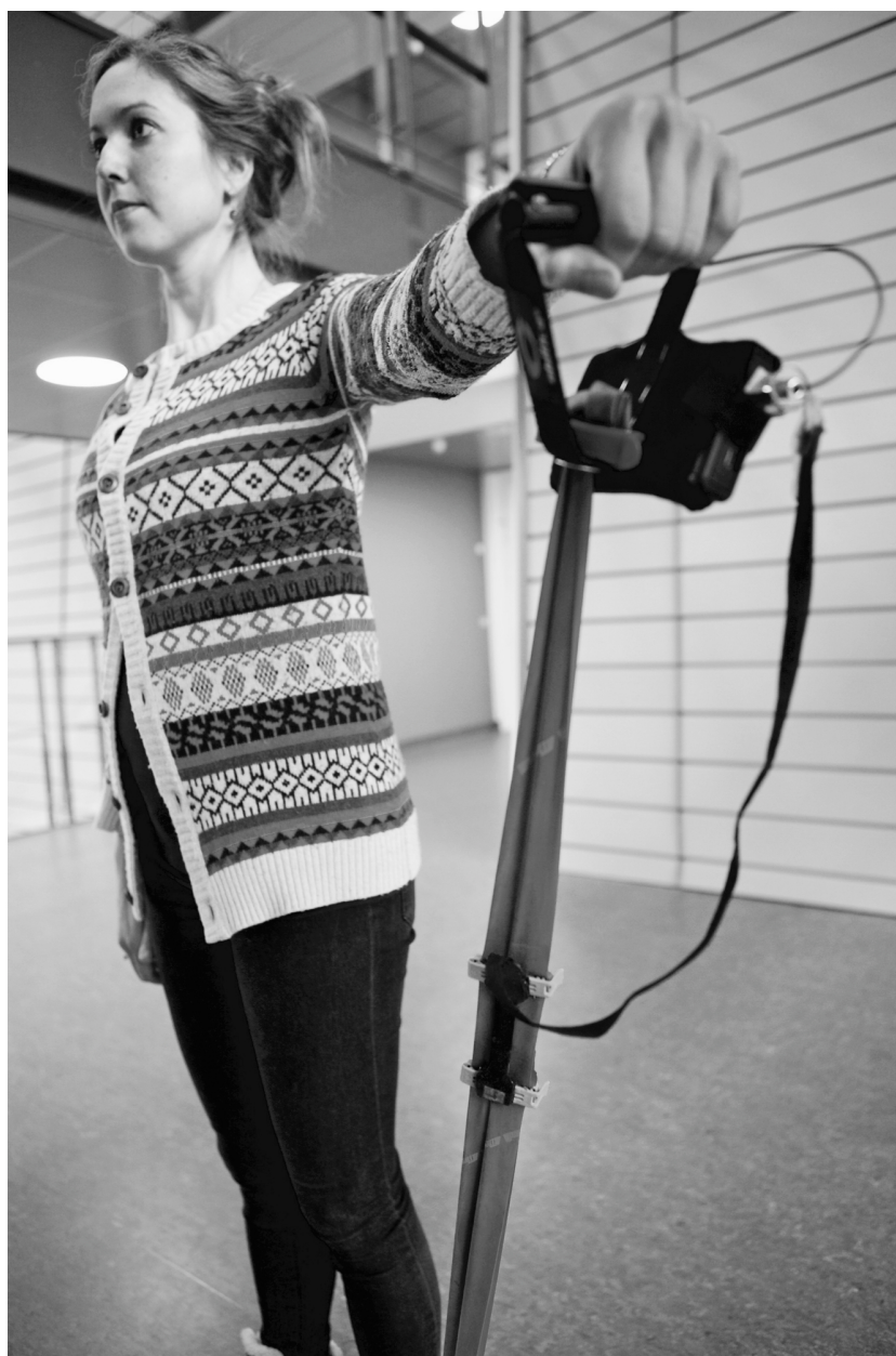
Figure 1 Shoulder abduction with the stretch-sensor attached to the elastic band.

correct exercise form. First, the participants saw the assessor perform the exercise correctly, and afterwards the participants performed the exercise themselves with feedback from a metronome to guide the correct TUT. The participants were given up to five attempts to find the correct TUT by following the beat of the metronome. After the practice, they had a two-minute break before the data collection. Each participant then completed 3 sets of 10 repetitions, with a two-minute break between the sets. The participants were verbally guided through the test if they did not follow the beat of the metronome, or if they did not use correct exercise form. Therefore, all participants performed the exercise correctly at