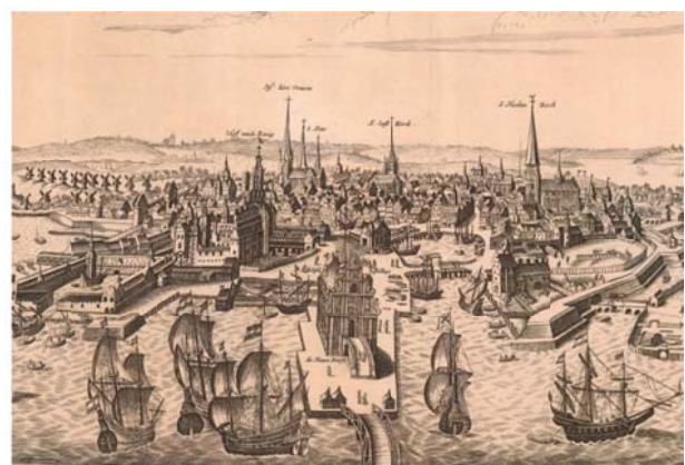
Four panoramic maps of popular cities: Quibec (1755), London (1845), St. Louis (1859), Copenhagen (1640)