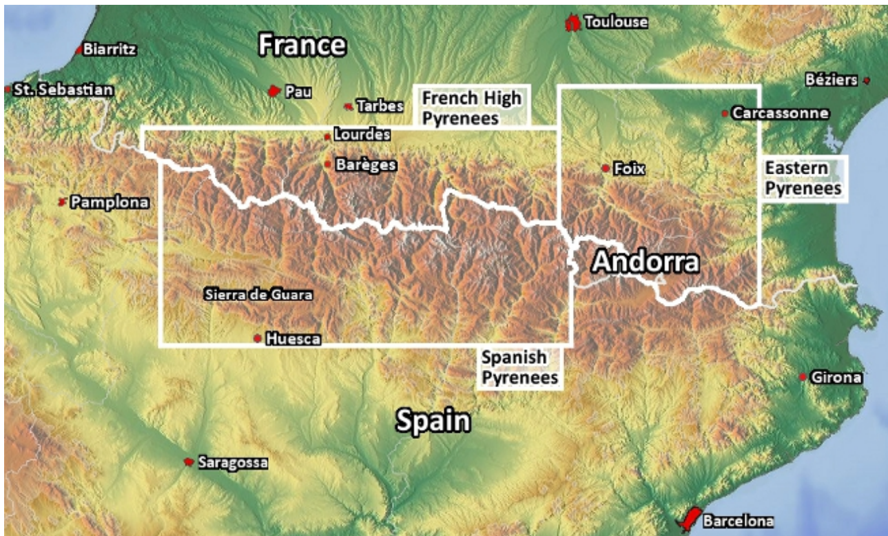
The scenery of Walking to Explore your Leadership in the Pyrenees 5

One of the participants was an HR - manager from a big company who wanted to explore the concept of anxiety and resistance. While walking up a path through the mountains the manager and his partner explored questions as: "What does anxiety mean?", "What is the virtue of anxiety?". "Is anxiety important for life and leadership?", "What is the opposite of anxiety?".