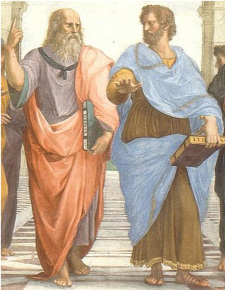
Plato and Aristotle in a walk 'n talk 4

The idea of Protreptic as a tool for leadership and management development today is to pull managers and employees momentarily out of the everyday hamster wheel of the operation level and give them the freedom to contemplate the essence of their private life and work life. In Protreptic (Larsen, Fogh Kirkeby, 2008, p. 53) it is forbidden to come up with specific narratives from everyday life and work. Values should be examined on a general human level and the idea is that the correct understanding of the basic values in life and work influences the way we work and live. Instead of private narratives we can use metaphors and allegories to get the conversation into body and space.