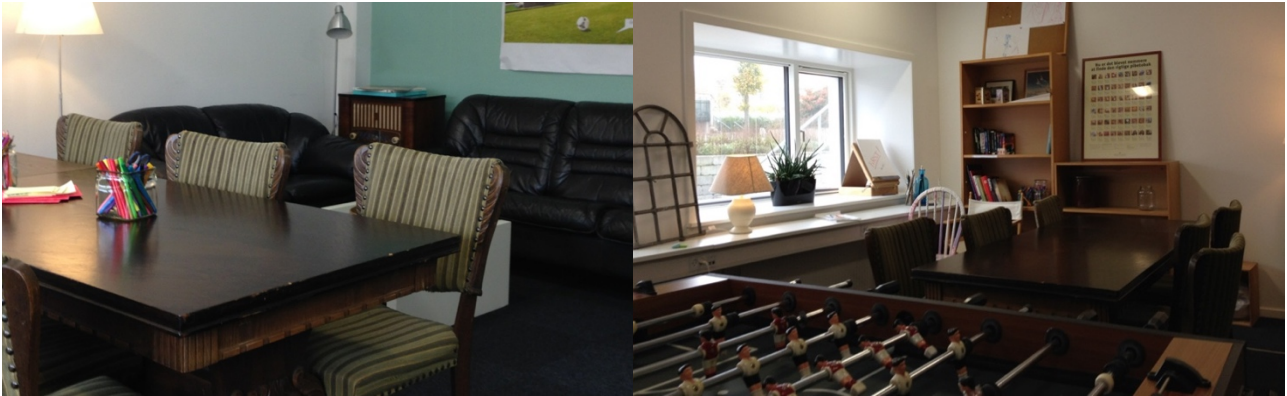
Figure 4: Photo-bits from the occupied room: ‘Mellemrummet’ (‘The Middle-Room’)

Prior to the suggestion of establishing a room for taking breaks in the outcome of the workshops, and prior to employees occupying the room one year later had been a process of walk-alongs during throughout the space of the City hall that enacted questions and comments between students and employees on the use of the configured space – also the configured space for taking breaks. The spatial discourse for taking breaks were addressed so to say. The table-soccer practice was mentioned. Later in the configuration of terrain boards using Object theatre it came up as well; that the room for these activities had been excluded during the rebuild. The table had been placed in the cellar.