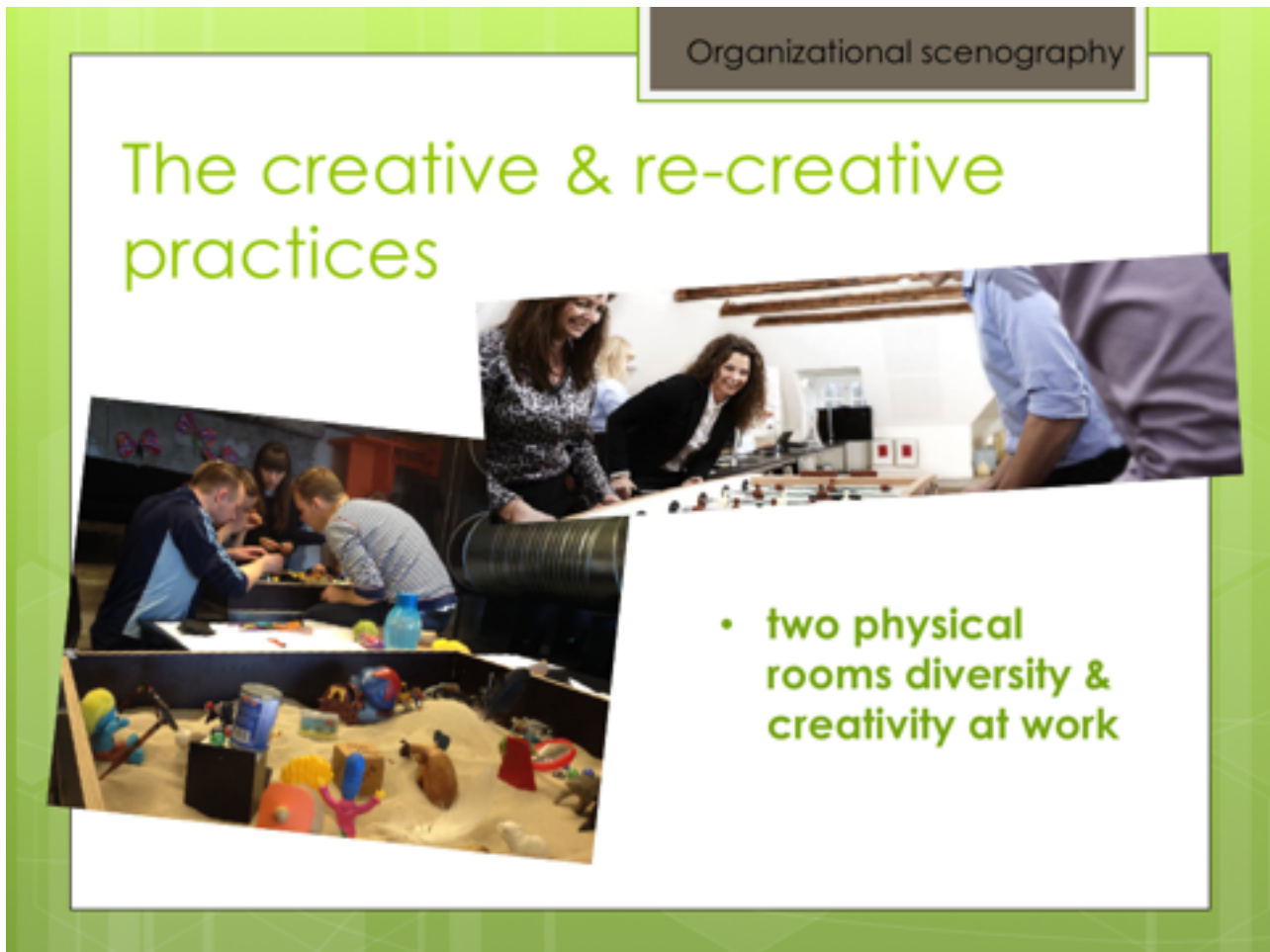
Figure 5: Aspect of the presentation at the City Hall April 2014.