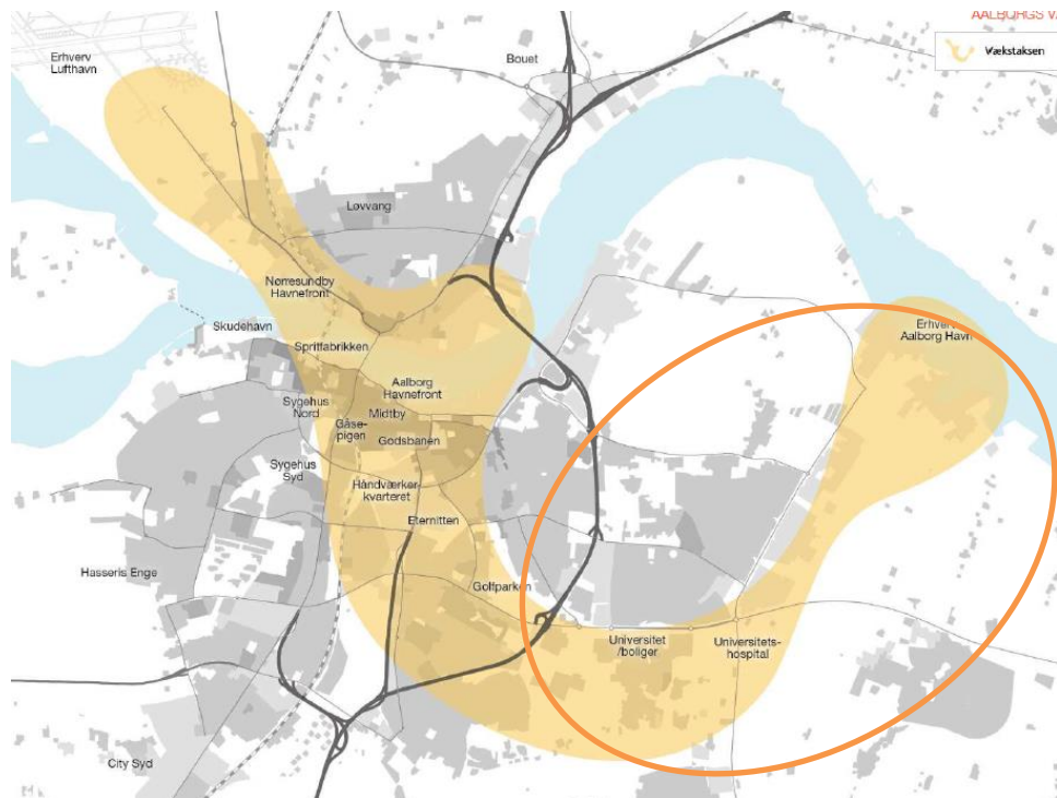
Figure 6: Growth Axis running through Aalborg Øst District