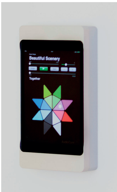
Figure 2. ‘The Music Star’.

The colours of the triangles fall into groups of four, with triangles in shades of blue, green, red and grey. Together the first 12 triangles can be seen as one continuum of music stimuli, starting with the least demanding stimuli in the first light blue triangle and increasing gradually to the most demanding stimuli in the last triangle in the red group. Playlists for special use can be assigned to the group of grey triangles at the bottom of ‘The Music Star’, for instance playlists for use in ambulances or in ECT treatment.