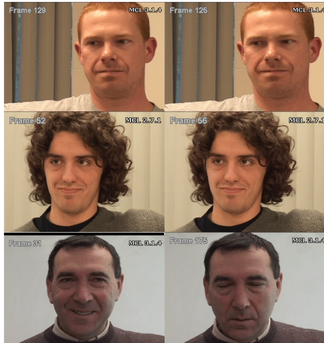
Figure 1: Pain and non-pain facial expression is sometimes very difficult to distinguish visually. Examples from the UNBC-McMaster shoulder pain database [39]. The pain frames are at the left and the non-pain frames are at the right.

density greater or corresponding image pixel density. Applying various signal processing tools is the other approach for enhancing the face resolution. One of the famous techniques is Super Resolution (SR). The basic idea behind SR methods is to obtain high resolution (HR) image from low resolution (LR) image or images [56,43]. Huang and Tsai [18] as pioneers of SR proposed a method in order to improve spatial resolution of satellite images of earth, where a large set of translated images of the same scene are available. They showed that the better restoration can be achieved rather than spline interpolation by using multiple offset images of the same scene and a proper registration. Since then, SR methods become common practice for many applications in different fields such as remote sensing [35], surveillance video [4,37], medical imaging such as ultrasound, magnetic resonance imaging (MRI), and computerized tomography (CT) scan[23,40,41,46].