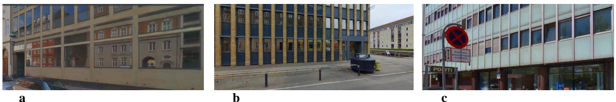
Figure 1 Building types: (a) building type 1, (b) building type 2, (c) building type 5.