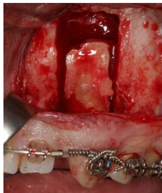
Figure 3. The dentoalveolar segment including the left maxillary canine was mobilized and bonded to the orthodontic arch in the correct dental arch position.

Orthodontic appliance were removed one year after surgery. Clinical and radiographic examination revealed a satisfying esthetic outcome with a neutral canine relation and no radiographic pathology, 18 months after surgery ( Figure 4 and Figure 5 ).