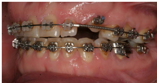
Figure 1. Pre-operative clinical examination. The upper left maxillary canine was partially erupted and infraoccluded compared to the adjacent lateral incisor.

Panoramic and intraoral periapical radiographs of the maxillary upper left canine revealed bony impaction with lack of periodontal ligament. There was no apical pathology and sufficient interradicular space between the adjacent teeth (Figure 2).