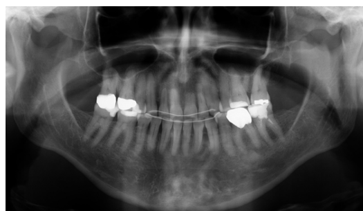
Figure 5. Radiographic examination 18 months postoperatively revealed no radiographic pathology.