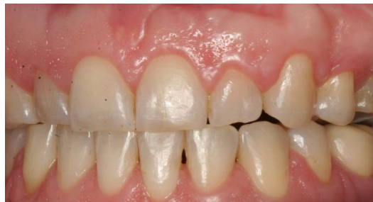
Figure 4. Clinical examination 18 months postoperatively revealed a satisfying esthetic outcome with a neutral canine relation.