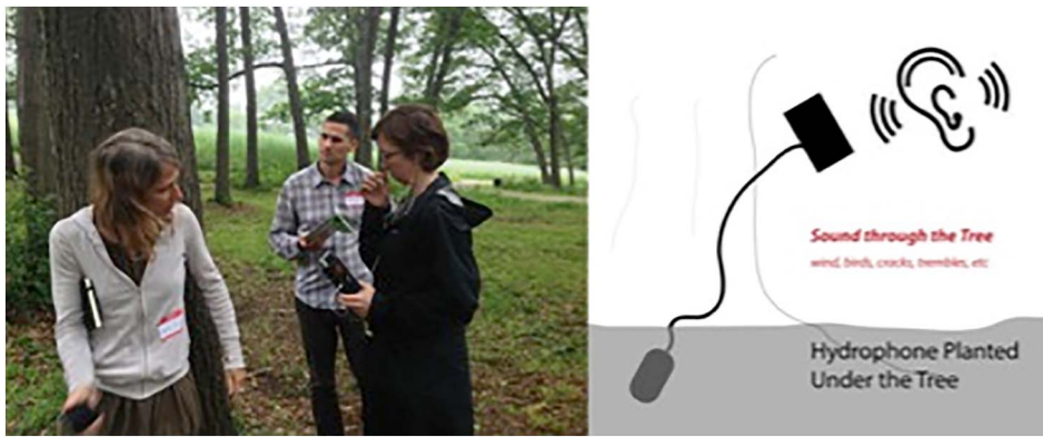
Fig. 2. Sketch for Bioprosthesis , a project for the sonification of trees. (2013, courtesy of http://stdesignworkshop.tumblr.com/post/60137874191/bioprosthesis ).

museums, companies that want to offer cultural services to the market, academia, government bodies. These stakeholders are located within their own cultural, economic, socio-material contexts, where diverse and specific languages are in place and at work. While developing Curarium , metaLAB used arts- and design-based materials such as sketches, motion graphics videos, data visualizations and interactive prototypes to interact with these multiple stakeholders: these were all ways in which technological ideas and curatorial concepts behind Curarium were translated into visual, audio,