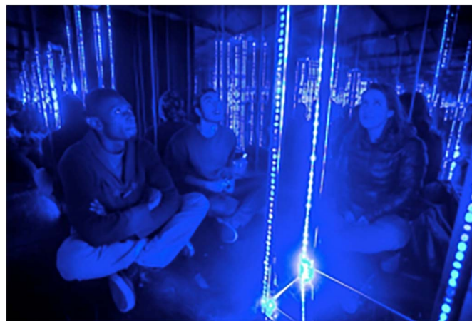
Fig. 3. A bit in the Abyss , by metaLAB. (2015).

The findings highlighted how metaLAB employs various art-based practices and design as a translational mechanism to connect and align various stakeholders in academic entrepreneurship. We will now use some categories of the Arts Value Matrix (Schiuma, 2011) to analyze how these translational mechanisms supported value creation. Examining metaLAB's projects shows that a common trait of the use of arts- and design-based initiatives is that they involve stakeholders first and foremost at a level that is entertaining, i.e. cognitively and emotionally engaging. Stakeholders taking parts in metaLAB's projects are