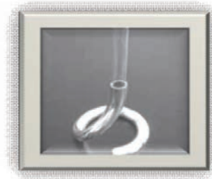
Fig. 2: Solitary Spiral and Bellevalia

The Figure 2 shows a piece obtained by plastic deformation where the spiral shape functions as an extension of a flower (Solitary).