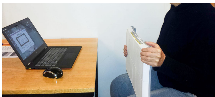
Fig. 1 Participant seated and squeezing the upper left corner of the Nintendo Wii Balance Board

Statistical analyses were performed using the Statistical Package for the Social Sciences version 22 (SPSS Inc., Chicago, Illinois). Each side was analysed separately using the three times 17 s of data for each session. From these data, CV was calculated in two ways [1]: SD divided by the mean force (CVM) and [2] SD divided by the target force (CVT), i.e. the actual value of the 5%, 10% or 25% of MVC. CVM and CVT were multiplied by 100 to convert into percentages. Furthermore, FysioMeter estimated the area between the target force line and the force produced. This was done by calculating the approximated area between target force line (yellow) and the force-time line (black) for ~10 ms increments of time. Thus, for each side we derived three variables (i.e. CVM, CVT and Area) for each percentage of MVC (5%, 10% and 25%) for each session. Every variable and their between-session difference were tested for normality visually (histogram) and statistically (Shapiro-Wilk test). Two-sample t test was used to test for differences between the old and young participants. Next, paired t test was used to explore systematic bias between test and