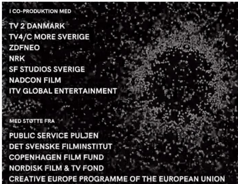
The funding scheme for Greyzone outlined in the title sequence.

Please, have in mind that this is a work in progress made ready for oral presentation. The argument delivered here only briefly touches upon the deep complexities of funding contemporary television drama.