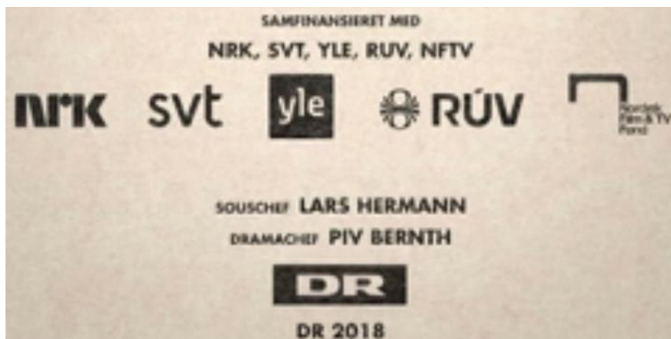
Funding scheme in the end credits of Liberty .

funding schemes for Danish and much Nordic television drama has, since the middle of the 90's, developed from mostly national funding to a complex funding scheme that includes both transnational sources, national funding systems and local sources, altogether what I refer to as glocal TV funding. 4