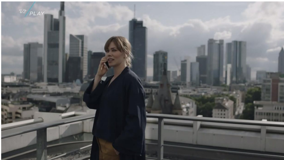
The 'German connection' as a textual result: the so-called 'Mainhattan' in Frankfurt am Main ( Greyzone , episode 1).