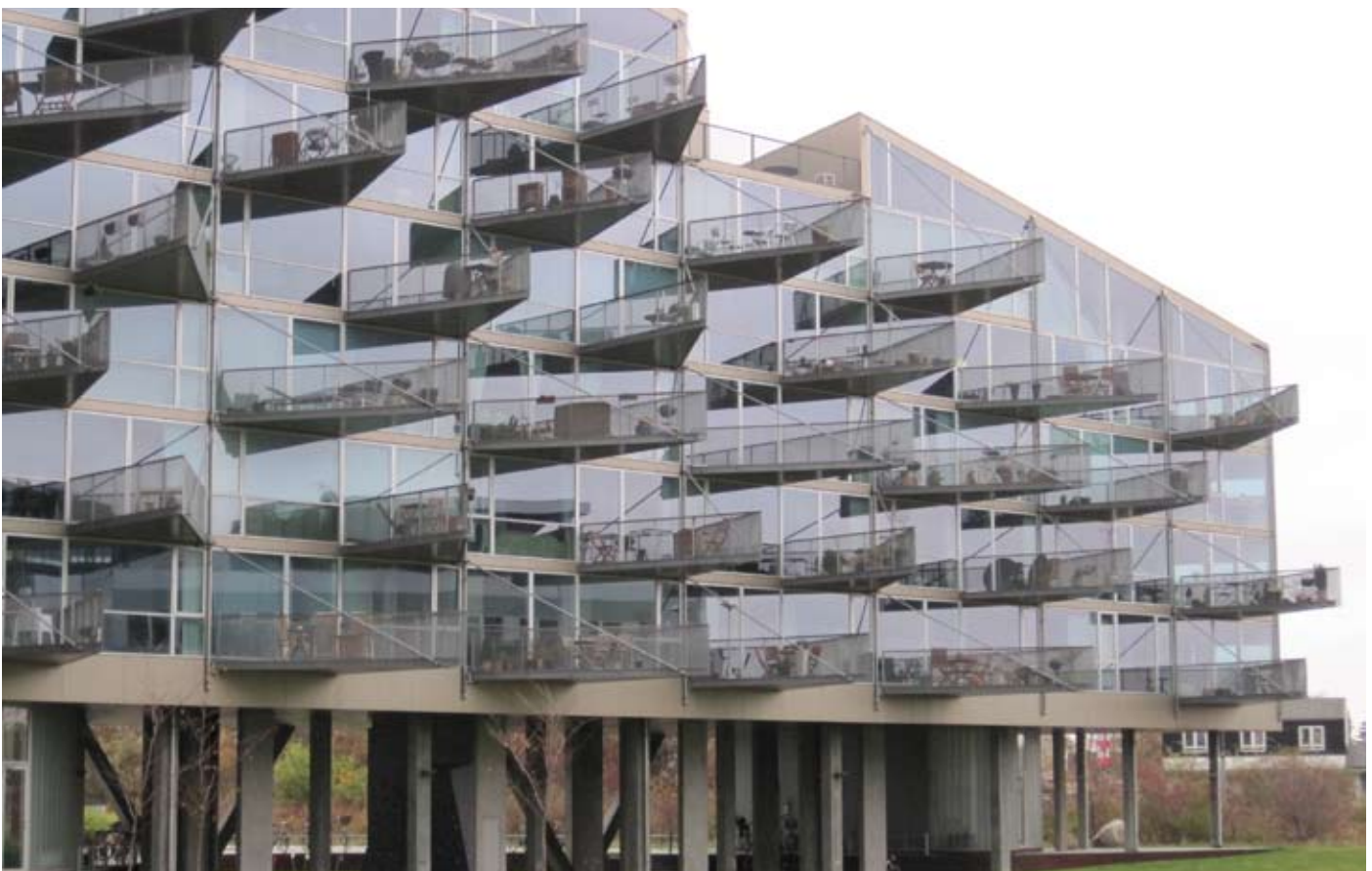
VM husene by BIG architects

The foam consist in other words of small cells that are separated by shared walls, and these walls are not to be seen as fixed and bounded but with and ongoing exchange between the cells. The physical substance of foam should here be taken seriously, as Sloterdijk sees the plural-spherology as consisting of co-isolated associations, where each chamber or cell makes up its own microsphere (Borch, 2009: ). The apartment block is foam architecture par excellence, as Christian Borch claims given that: “the multiplicity of units are stacked above and next to one another meaning that these shapes share with unstable foams the principle of co-isolation, meaning that spatial separation by shared walls” (Borch, 2008: 55).