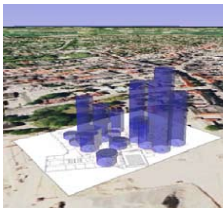
Map 1: Thursday men all ages