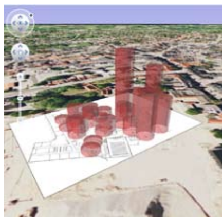
Map 2: Monday women all ages