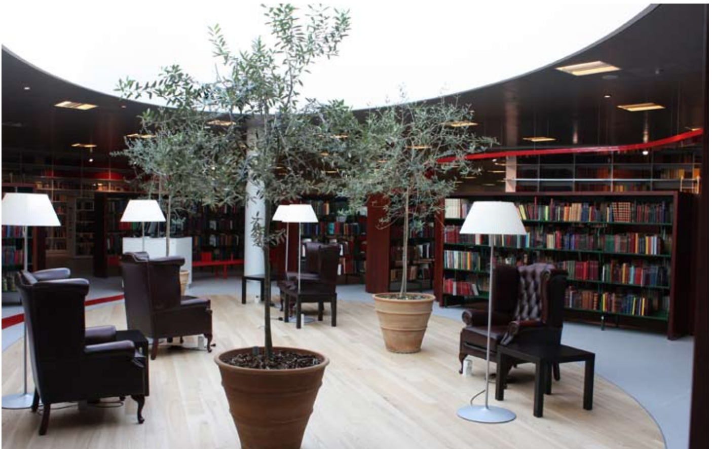
Hjørring library / Old department

Map 1 illustrating movement patterns from the male respondents during a weekday a concentration of activities in the 'old department' area 3 is shown. This area is containing omitted books and journals which normally would be in storage but is now a part of the library decoration creating an atmosphere of an old library. The book shelves in this corner of the library are kept in brown colors and the zone is centered towards four big Chesterfield armchairs all in brown. Sitting in the armchairs allow the user for looking up the sky and watch the clouds passing by through a big sky light in the ceiling. The chairs are surrounded by olive trees which contribute to the calm atmosphere in this zone. What is shown on map 1 is an example of a micro sphere that has emerged based on the imitation from the male respondents all gathering in this area. Put differently the combination of the elements in the zone affects the users and the process of imitation can be described as the micro sphere is emerging.