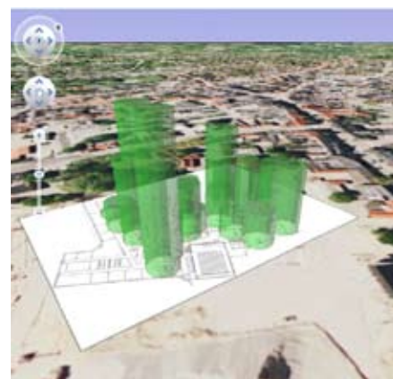
Map 3: Saturday men and women all ages

All three maps show that the main activity during a day is taking place in the upper right corner where the main entrance is located; area 1 from the overview plan. All activities regarding lending, handing in or renewing materials are carried through in this area, why these columns doesn't seem to cause much attention. A micro sphere developed from the activities from this area seems to be quite stabilized during indifferent to whether it's on a week day or during the weekend.