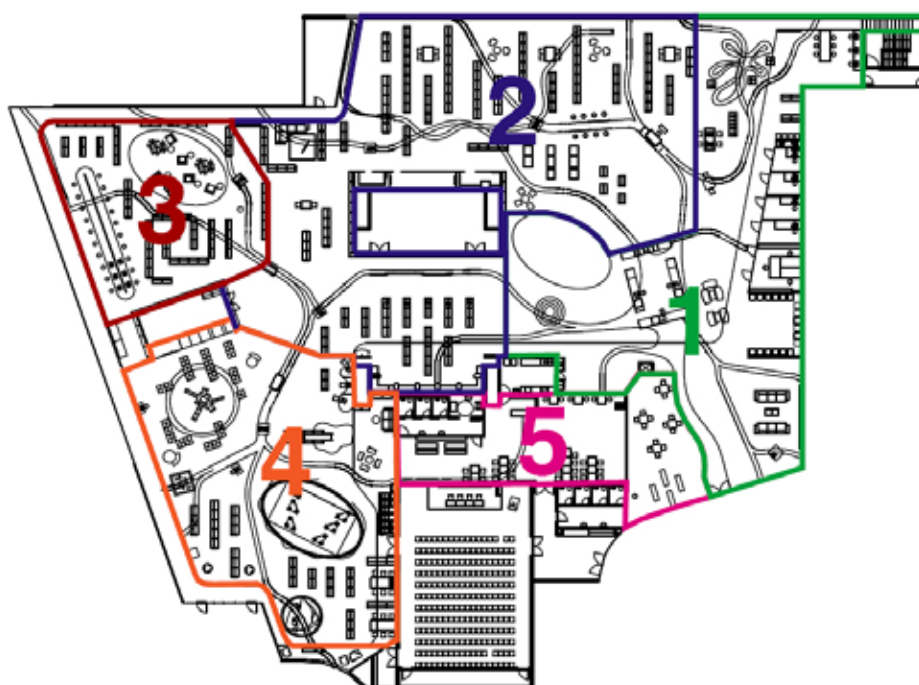
Hjørring library / Overview plan

The survey in Hjørring was carried through with the aim to register the different movement patterns taken place in the library during opening hours. A need that has appeared in light of the fact that the library now functions as a public space were one half of the users visit the library for other purposes then lending materials. Through the registrations it become possible to map out where (in which areas) and for how long the users stay when visiting the library. During four days a total of 252 respondents were participating in the survey. When working with the RFID data the library was divided in five different areas, all representing different functions. The five areas are illustrated below on the overview plan.