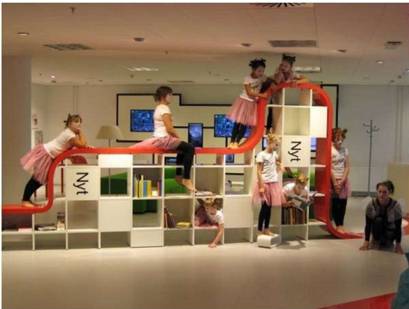
Hjørring library / www.bibliotekerne.hjorring.dk

the books that normally would have been in storage. Thus the library no longer only offers the possibility for lending materials; it also offers the possibility to get inspirations and experiences. These experiences are all supported by a creative and multi functional interior design that encourages the user to an active involvement and engagement with the surroundings (Lauridsen, 2008). It is the Danish art group Bosch & Fjord in collaboration with the Library of Hjørring that has transformed the library into a multi functional experience – and knowledge center. What characterizes the library is a red ribbon – a mediatory element which passes through the library, sometimes in the floor sometimes moving up from the floor turning into shelves, bookcases, exhibition furniture, seats, gates tables and bar stools, librarian service points etc. It twists and turns through and around bookcases, furniture and other equipment. At some point the red ribbon is used as a platform for introducing new materials, at some places it simply grows up in the air and becomes art (Søndergaard, 2009: 75).