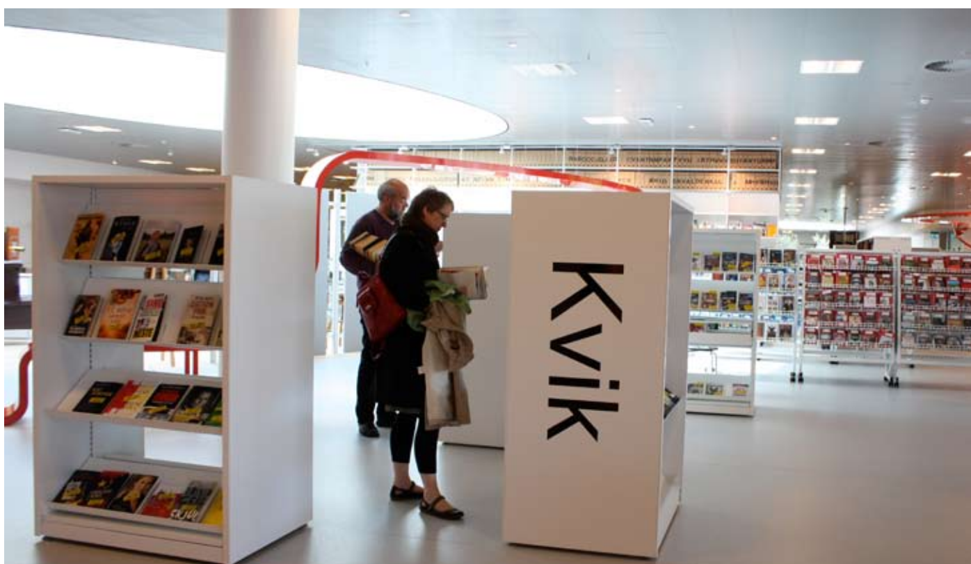
Hjørring library / Adult lending department

Map 2 shows another narrative concerning the women's movement patterns. As earlier explained, there is an immense activity registered in the entrance area. This is the case for almost fifty percent of the female respondents. As a contrast to the male respondents the female registrations are spread all over the library with no clear point of gathering. Does the map show that there is no particular imitation taken place amongst the female respondents? And does this lack of imitation prevent the emergence of a certain micro sphere? If this is the case there is no particular design thorough enough to create a performative space mostly affective for the female users. Maybe this is what the map illustrates?