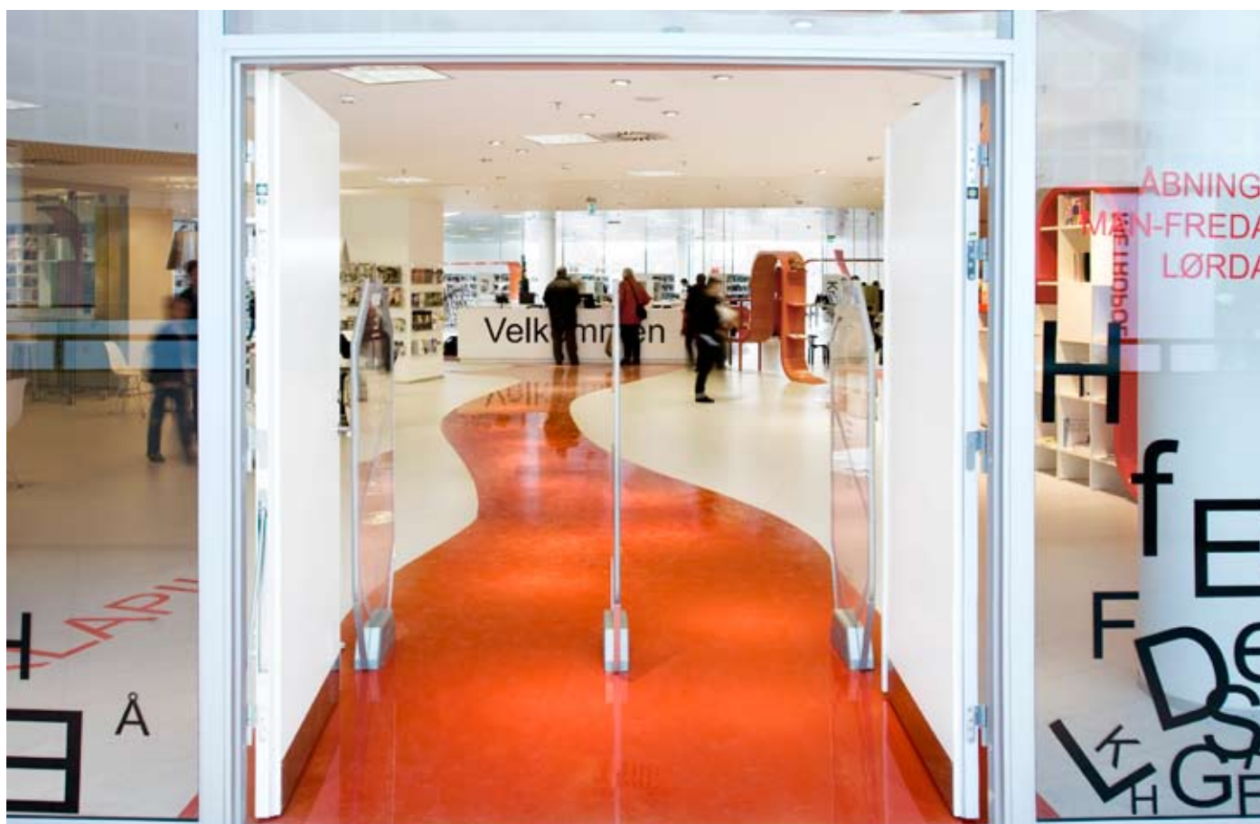
Hjørring library / Main entrance

All three maps show that the main activity during a day is taking place in the upper right corner where the main entrance is located; area 1 from the overview plan. All activities regarding lending, handing in or renewing materials are carried through in this area, why these columns doesn't seem to cause much attention. A micro sphere developed from the activities from this area seems to be quite stabilized during indifferent to whether it's on a week day or during the weekend.