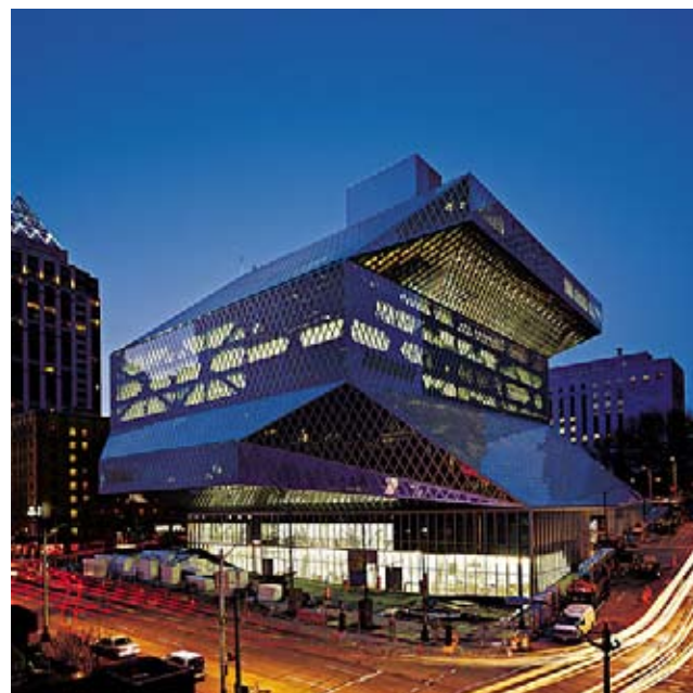
Seattle library by OMA/Rem Koolhaas

In the abovementioned case we see an example of expanding the traditional function of a library to a social and cultural meeting place by integrating the architecture as an active player which transforms the common routine of visiting a library into an experience. It is the new user demands combined with an iconic architecture that inscribes these contemporary public libraries in the experience economy, where the performative space is in focus (Kiib, 2009; Pedersen, 2005). By means of the performative spaces the user becomes the central part for creating their own unique experience every time they visit the library as they are encouraged to interact with the flexible and changeable surroundings. Thus the space is defined by the users and the dynamic their interrelations create, and the space has to be understood as something emerging and not a container within action takes place (Blackman & Harbord, 2010: 5). All elements are embedded in these multiple and changeable places that make the space performative. For the space to be fully unfolded the space is therefore depending on the interaction between the framework, the light, colours and the meeting with other user groups “which gives the user the possibility of experiencing the surroundings in ever-changing constellations” (Oxvig, 2010: 208).