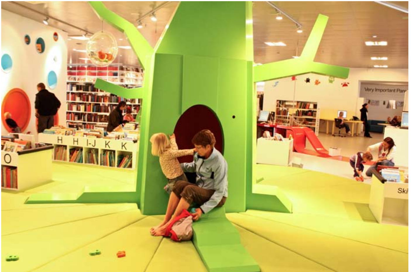
Hjørring library / children department

As in the case with map 2, there is no single activity making the opportunity for one sphere to emerge as seen in the 'old department' area. How smaller micro spheres are embedded in this bigger sphere is not possible to register. The RFID tracking therefore seems useful to give an idea of where the most activity is taking place during the day. On Saturday it is centered in the children's area, during weekdays women are spread more or less evenly all over the library. To give a more enriched registration of the emerging micro spheres, would require another and much more detailed RFID setup, which was not the case with the Library of Hjørring survey.