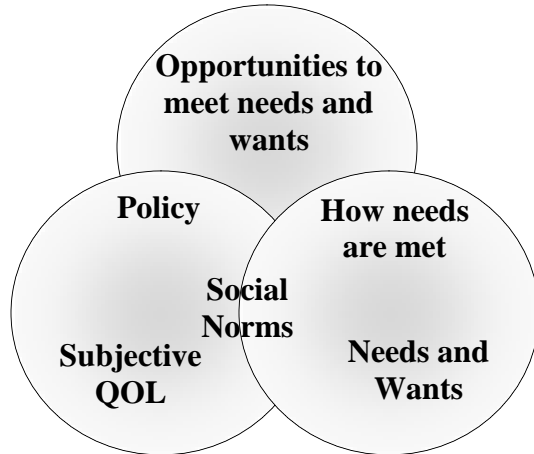
Figure 1. Factors Affecting Quality of Life

Figure 1 depicts the global focus areas and their interconnected influence on QOL outcomes.