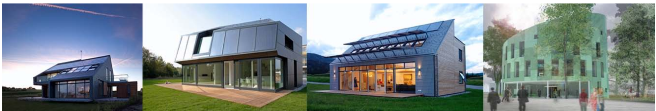
Pictures (including one rendering) of four of the eight Active Houses