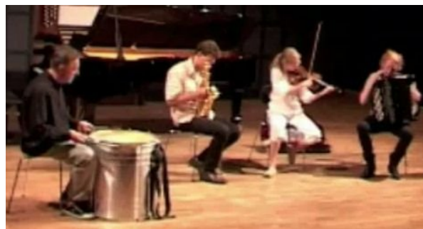
Fig. 1, 2. The teacher is seeking for eye contact all through the execution and he is able to connect with the accordion player, who afterwards starts to beat his instrument with the other hand.