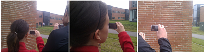
Fig. 4. Participants experiencing problems with visualising a house extension related to inaccurate 3D registration.