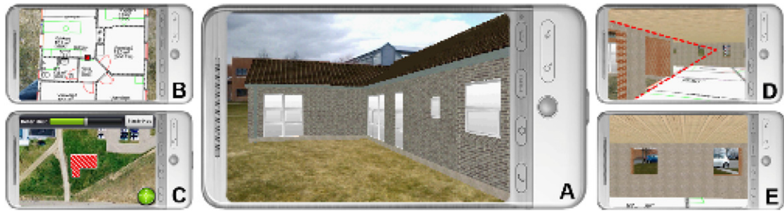
Fig. 2. ArchiLens. A: Screen capture of a virtual house positioned on a lawn. B: Screen capture of the Blueprint View, showing a general overview of the floor plan. The red square represents the user's position on the blueprint. C: Placement View for house placement and rotation. The red shape represents the house, and touching the screen makes it possible to rotate the house. Notice the added dashed dividing lines between the roof and walls moving inwards and thereby creating perspective. D: View from inside the house. Notice how the physical surroundings are visible through the windows in the virtual walls. E: Future view through the windows of the living room. Notice how the physical surroundings are visible through the windows in the virtual walls. (For interpretation of the references to colour in this figure legend, the reader is referred to the web version of this article.)