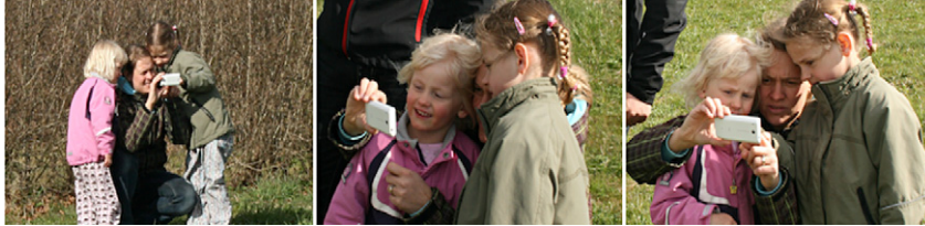
Fig. 7. Parents showing their future house to the children and pointing out their bedrooms.

black” [B]. Here the participant used ArchiLens as a tool for verifying decisions in context. She later confirmed this decision in the post-construction interview. It also showed that the couple did not want to stand out from their neighbours. As newcomers they wanted to fit in with the architectural style of the area.