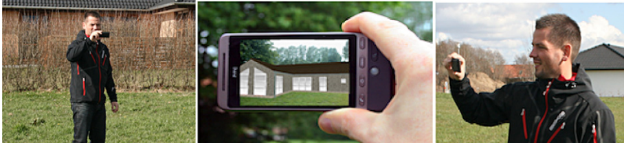
Fig. 3. People achieved a better understanding of the visual appearance of their future house when using ArchiLens.