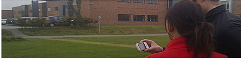
Fig. 5. Participants trying to understand contextual influences of nearby houses.

Two of the families participated in two sessions on their lot. One of these families used the second session to review the redesign of a carport, which had emerged from the first session, as well as other changes. This active participation in the design process and single iteration of changes helped them develop their understanding and imagination of physical movement around the house: “We have talked about how quick we would be able to drive into the carport from the road—we were afraid it would be too ‘racing like’. But now that I can see it from here, I actually don’t think it is going to be a problem” [D].