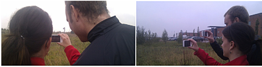
Fig. 6. A couple obtaining a collective understanding of their future home through ArchiLens.