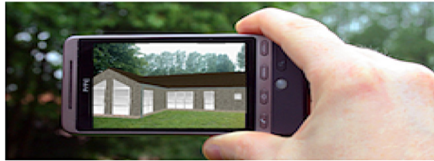
Fig. 1. Visualising architecture in context on a mobile phone while standing at the building site.

problematic on mobile devices due to limited performance. However, with recent leaps in smart phone technology, such as higher CPU power, better displays and cameras, and spatial sensors like GPS and compasses, designers are now able to make advanced mobile AR applications available to ordinary people without requiring special and expensive hardware.