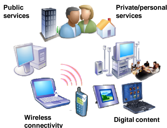
Figure 1 Connectivity and mobility scenario delivering smart applications.

the domains showing an inherent complexity, where smart things create substantial economical or social benefits with respect to current practices.