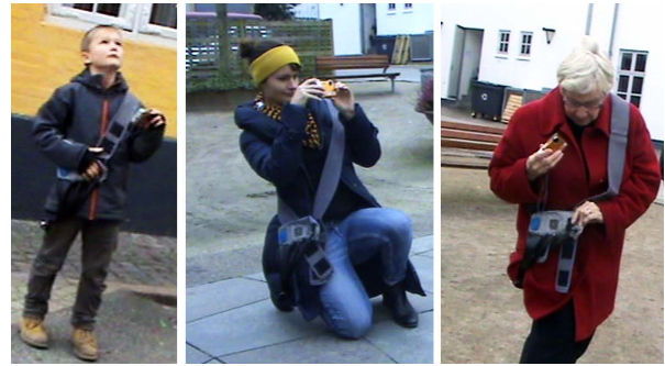
Figure 1. Participants in the field A. 7-year old male B. Female mid 20's C. 79 year old woman.

mobility field studies. In this paper we investigate tactile sensitivity over a significant age range (from 7 to 79 years), with a relatively equal distribution of gender and age and under field conditions. We vary activity levels in the field to occupy and intentionally distract the test subjects while requiring they detect vibration stimulus from a wearable belt, see Figure 1.